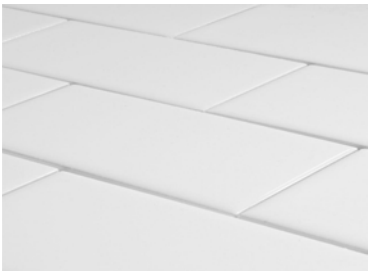
Owner's Bath Surrounds