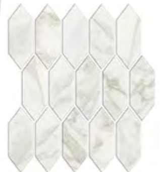
Kitchen Backsplash Tile