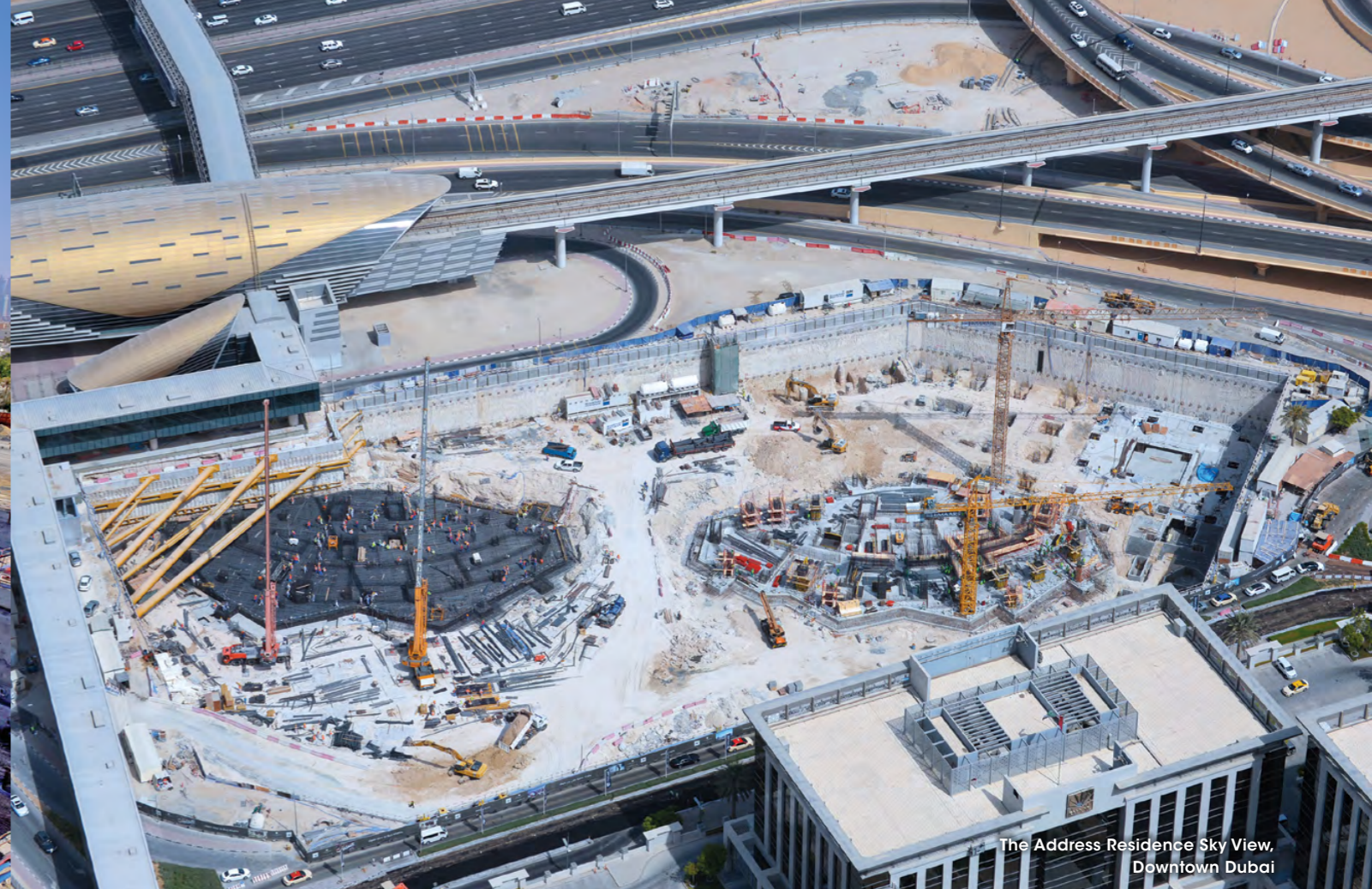
The Address Residence Sky View, Downtown Dubai