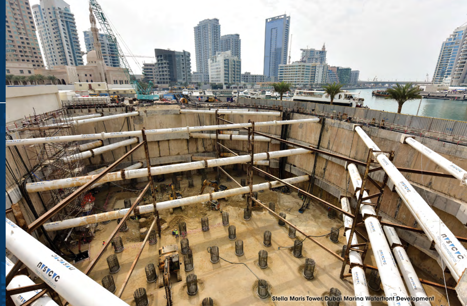
Stella Maris Tower, Dubai Marina Waterfront Development

To foster a dynamic environment of growth and challenge by empowering NSCC employees and rewarding good and sensible business decisions in a manner consistent with best practices and proper business process.