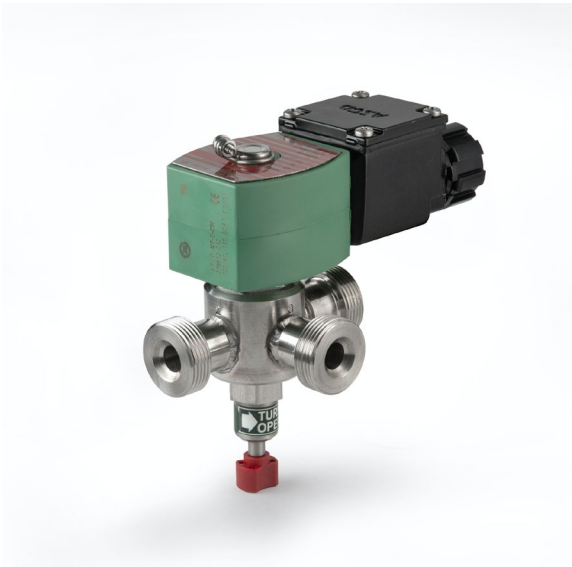
Caption: ASCO's fire-hardened valve.