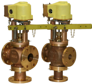
Caption: ASCO's bilge valves with modified manual reset.