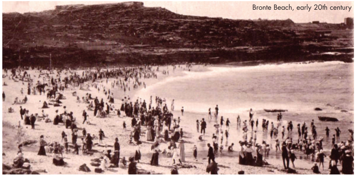
Bronte Beach, early 20th century

But issues of starvation and political instability in the new settlement began to dissipate towards the 1840s, when the trappings of a free and developed society – such as elections – started to appear in the city, which by then had been under British rule for more than 50 years. The development of Sydney