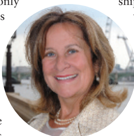
Baroness Helena Kennedy

As the panellists will indicate, the IBA's aim in this regard is to produce a sort of uniform legal template that can be adapted and built on, and a marker to help answer questions about the uncertainty of legal authority and what regulations could ultimately look like.