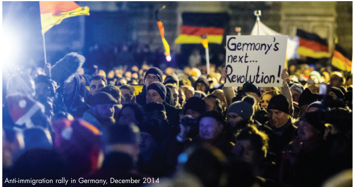
Anti-immigration rally in Germany, December 2014

The bar associations cannot remain silent in these situations