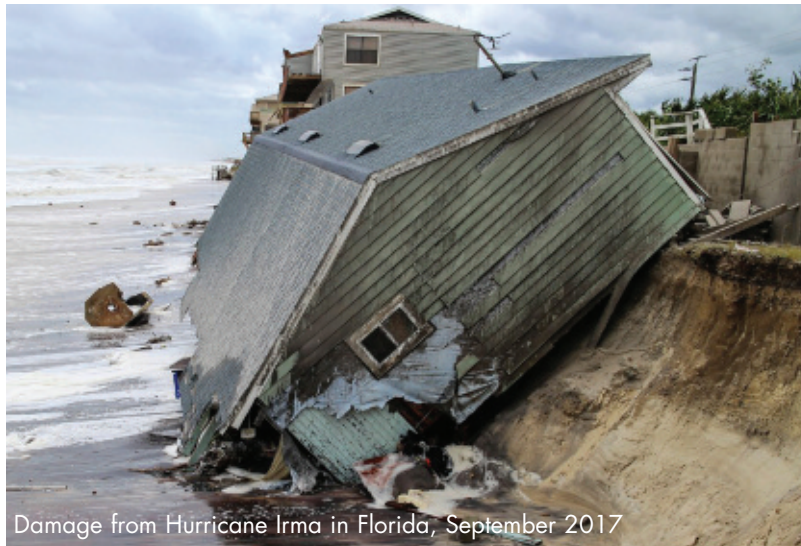
Damage from Hurricane Irma in Florida, September 2017