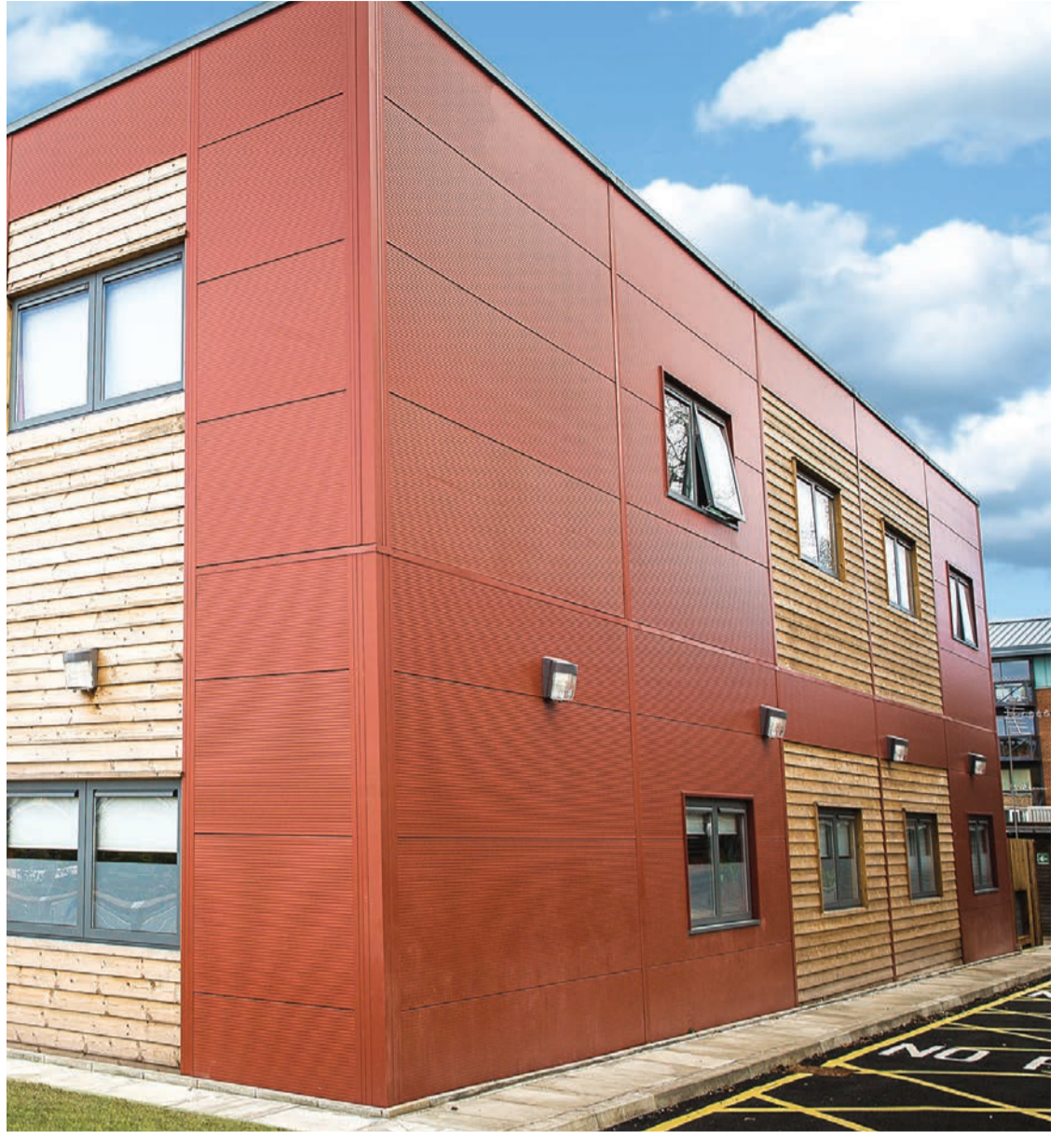
West Middlesex Maternity Unit is a current facility on long term hire with MCH

In the public sector there is often a requirement for funding solutions to be classified as being 'off balance sheet'. MCH's knowledge of accounting standards (including SSAP21, IFRS, GAAP, and IAS17), coupled with our experience in consulting with public sector auditors, ensures that we are able to consistently structure solutions which meet the relevant accounting requirements.