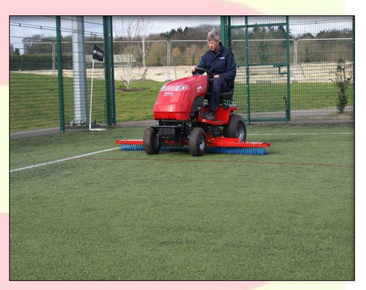
DRAG BRUSHES FOLD DOWNTO ALLOW A LARGE 2M SPAN