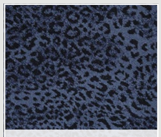
8201/0003 - Leopard-Ax/Blue