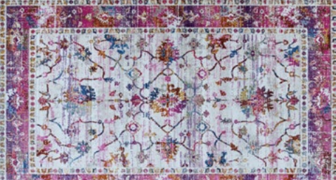
4993/0791 - Nurata/Amethyst