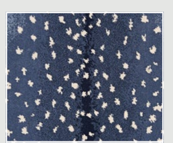
8101/0003 - Antelope-Ax/Blue