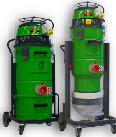
202DS / 202DSLP