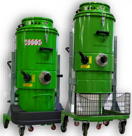
M450 / M450LP