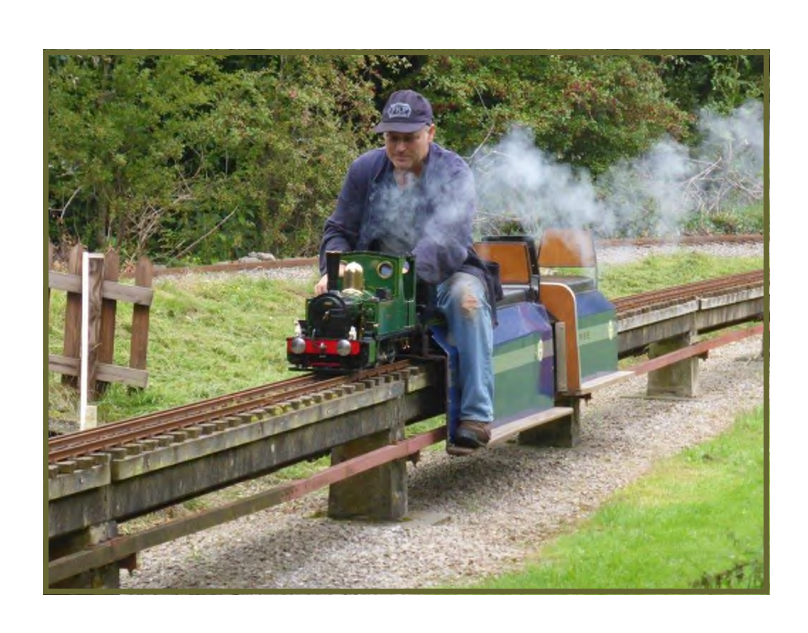
Issue 3 March 2016