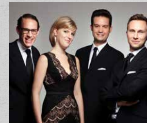
Doric Sting Quartet