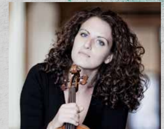
Liza Ferschtman - violin