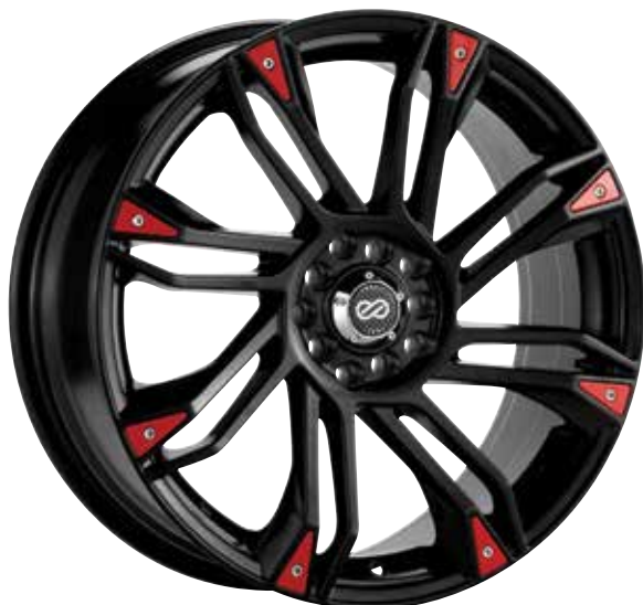
Matte Black with Red Trim