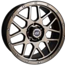
Gloss Bronze (Special Order)