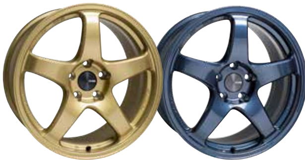
Gold (Special Order)