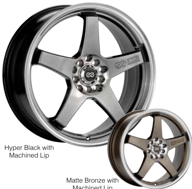
Hyper Black with Machined Lip