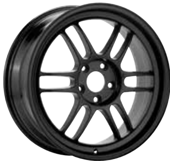
Black (Limited Sizes)