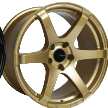
Gold (Select Sizes)