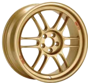
Gold (Limited Sizes)