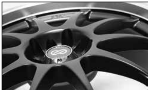
Matte Black with Machined Lip