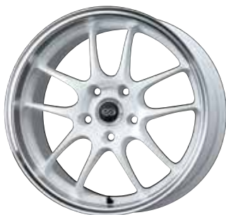
White with Machined Lip