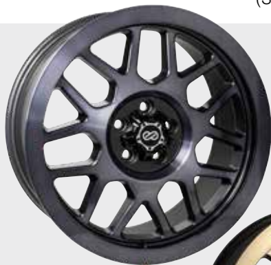
Brushed Black (17" only)