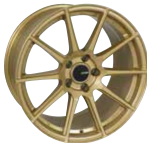
Gold (Select Sizes)