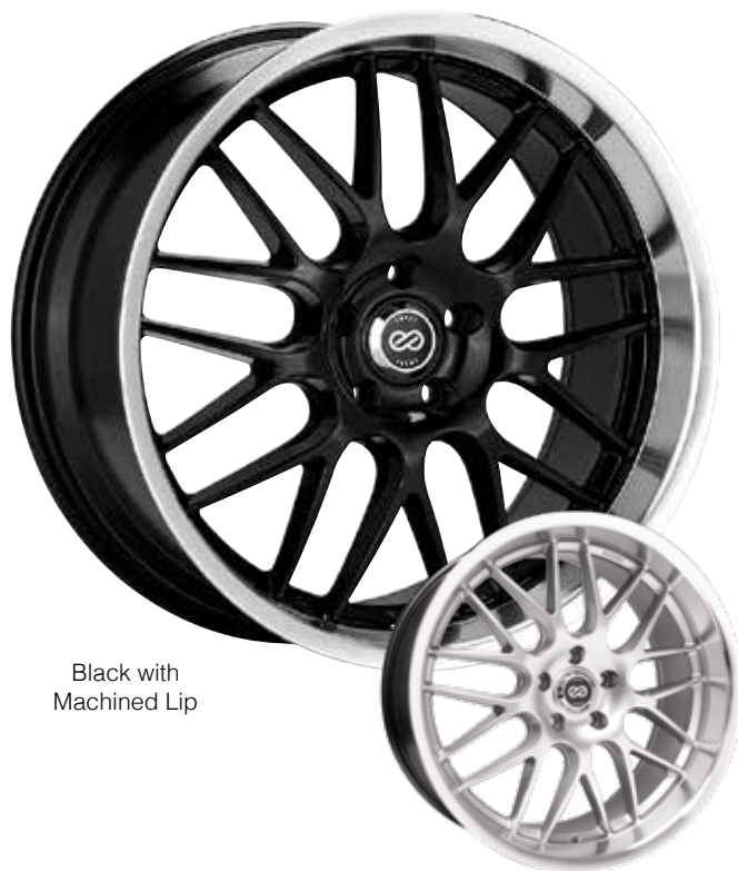
Black with Machined Lip

Ford, Volvo, and Chevrolet fits available.