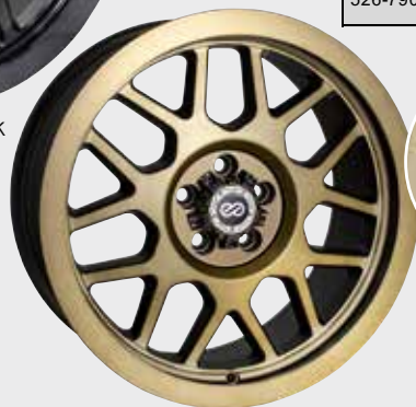
Brushed Gold (17" only)