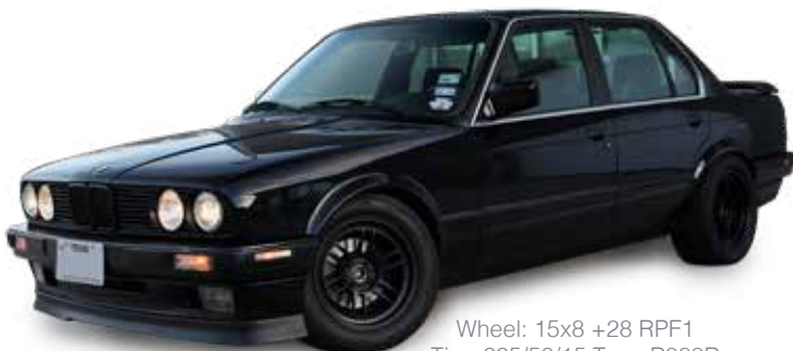
Wheel: 15x8 +28 RPF1 Tire: 225/50/15 Toyo R888R