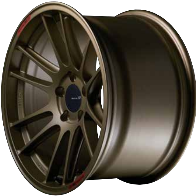
Titanium Gold (Limited Sizes / Special Order)

The GTC01RR is made after one of our strongest wheels, the GTC01. After vast research, we were able to keep the high rigidity while making it light weight, comparable to the RPF1. The GTC01RR has been tested in high performance categories including cornering, braking, acceleration, deceleration, and steering response. The GTC01RR is available in three different concave faces as displayed below.