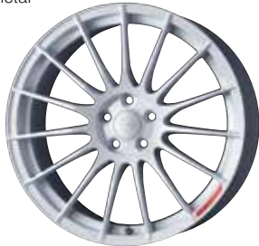
White (Limited Sizes)