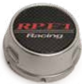
Optional cap for 15x8, 16, 17, and 18 inch RPF1 (A379-0000SP)