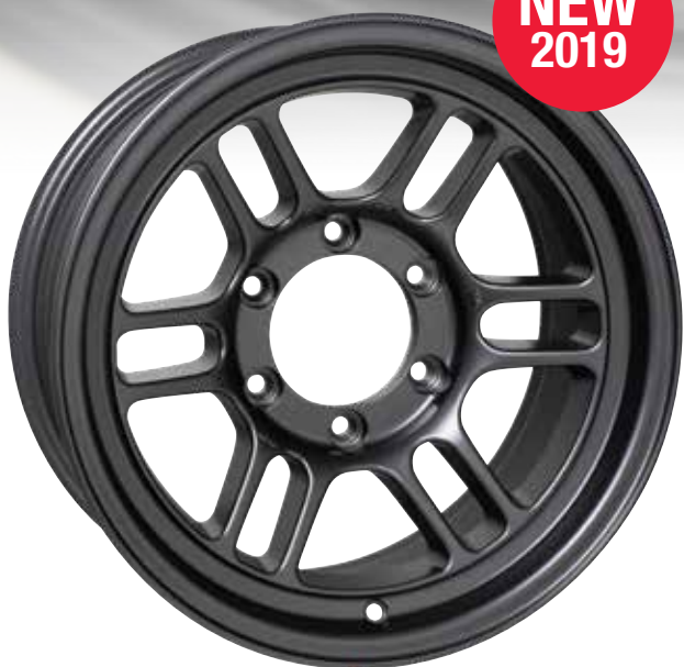
Matte Dark Gunmetal

The Enkei RPF1 was first introduced to the world in 2002 and it was an instant hit thanks to its high strength, low weight, and no-nonsense design. Truck and SUV owners have often asked for Enkei to develop an RPF1 for them and we listened. The all-new Enkei RPT1 features the same clean split spoke design as the RPF1, but is built to higher loading capacities to suit 6-lug trucks and SUVs. Available in 16" and 18" applications and a variety of colors, the RPT1 is one of the lightest weight and toughest truck wheels on the market today.