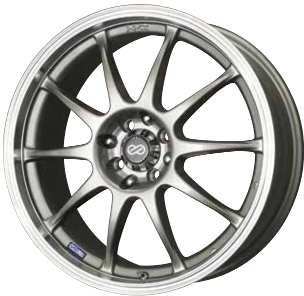
Silver with Machined Lip