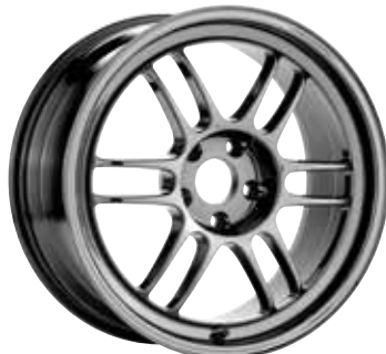
SBC (Limited Sizes)