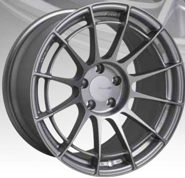
Matte Silver (Limited Sizes / Special Order)