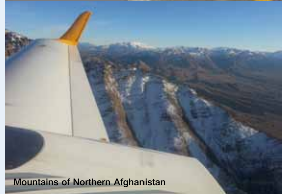
Mountains of Northern Afghanistan