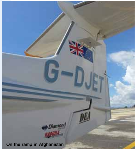
On the ramp in Afghanistan

The purchase demonstrates the company's commitment to customer service and company growth.