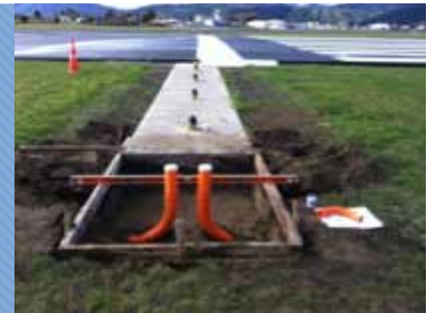
Airfield lighting work at Kapiti Airport

Radiola is pleased to partner with Kapiti Airport Holdings limited for the provision and maintenance of the airport lighting systems. In support of Air New Zealand scheduled operations the complete airport lighting system has now been replaced. Radiola continues to support the Hamilton Real Time Passenger Information System and is investigating technologies that could future proof the system and provide enhanced capabilities. As demonstrated by a recent navigation system installation in Mexico, Radiola engineers offer a wide range of skills and the flexibility to enable complex projects.