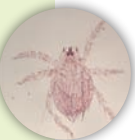
Harvest mite down the microscope