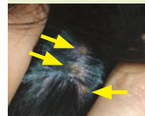
The bright orange mites often cluster together and are commonly found between the toes

As temperatures drop and the nights draw in it's great to get out and active in the Autumn, but there are some factors that still need to be considered to keep our pets fit and well. With this in mind, here are a few topical tips: