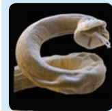
Electron micrograph of an adult lungworm

Lungworm photo: courtesy Bayer. Cat photos: Jane Burton.