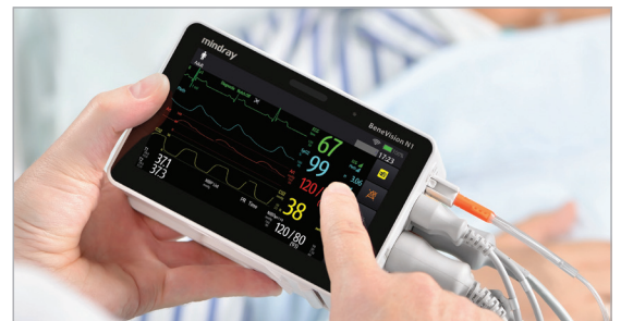
Shared parameter modules, accessories, and common mounting options provide flexibility across the N-Series platform

Serving as both monitor and module, the adaptable N1 provides, continuous monitoring throughout a healthcare facility. Seamlessly integrating into the hospital IT environment, the N1 is a multi-parameter module within the N12, N15, and N17; when removed, it instantly converts to a wireless transport monitor, ensuring a gap-free patient record, from admittance through discharge.