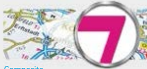
Composite Colour Reduction