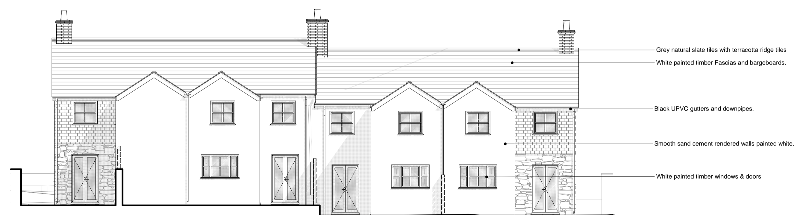
Rear Elevation 1:100