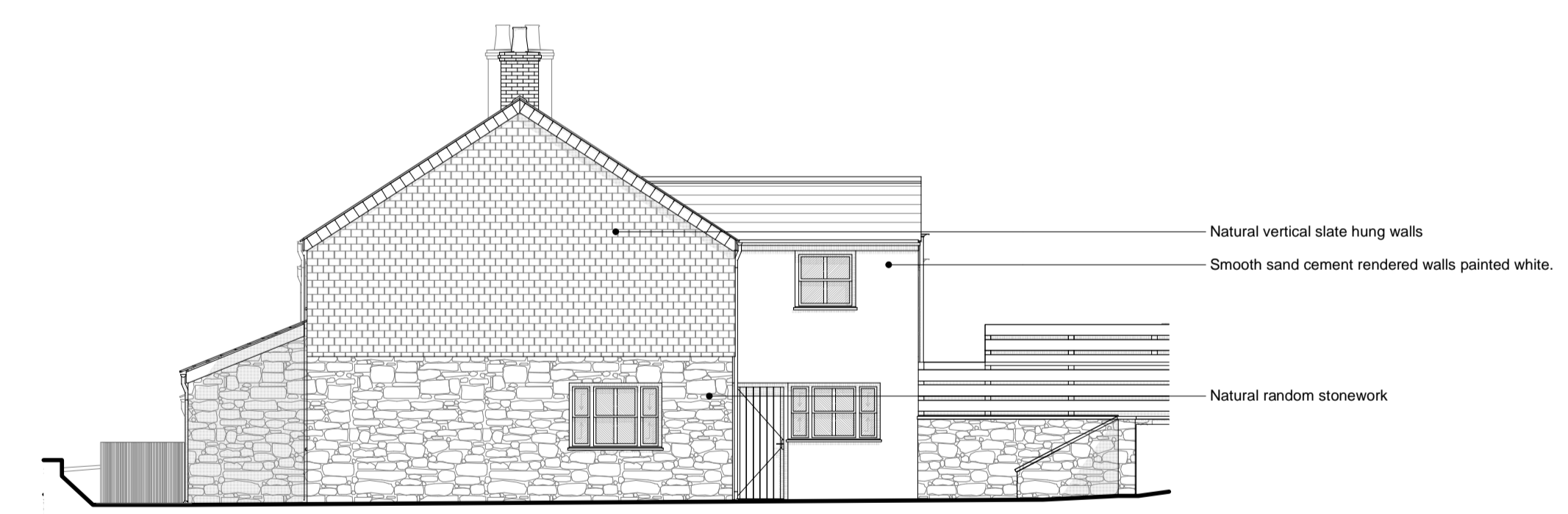
Side Elevation 1:100