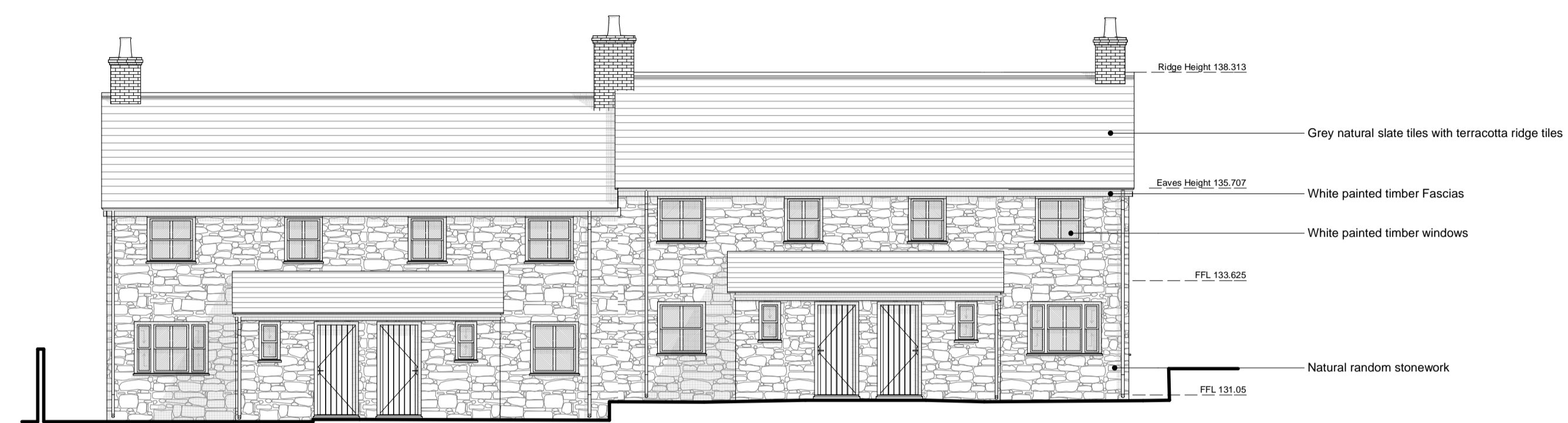
Front Elevation 1:100