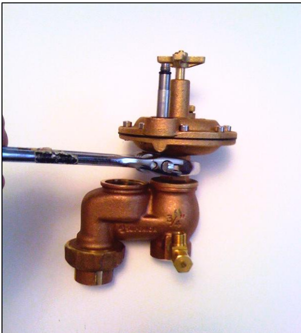
Photo of actuator after being removed from valve body.

5. Apply a wrench to the hex neck of the actuator and unscrew it from valve body.