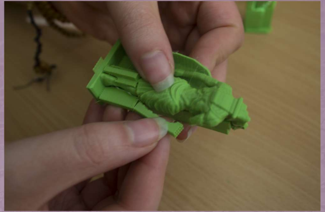
Break off vertical supports