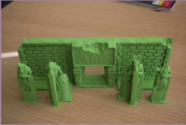
Remove parts from printbed