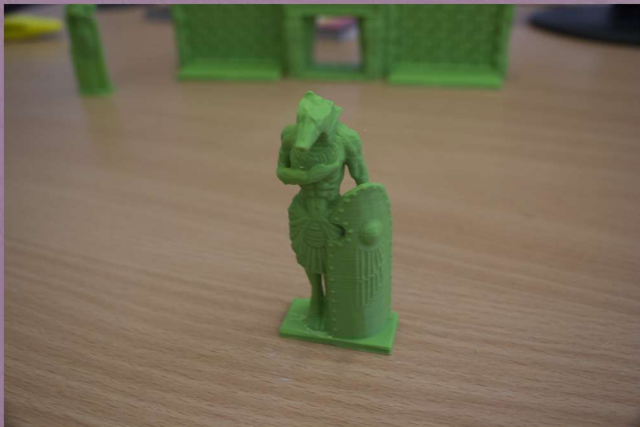
Wallah! All done :D