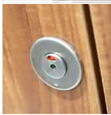
High quality brushed stainless steel hardware