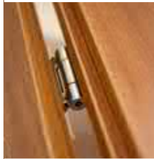
Rebated doors pilasters to create flush front cubicle