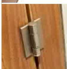
Stainless sprung loaded hinges with concealed fixings