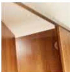
Pilasters braced with headrail for lateral stability