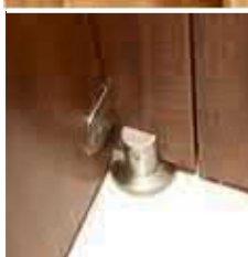
High quality stainless steel hardware