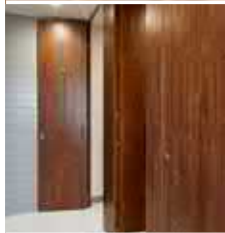
Full Height Cubicles for ultimate privacy