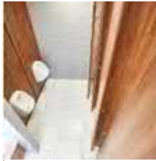
Clean, striking aesthetics