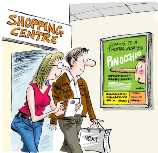
...seeing our poster boards again on the way out