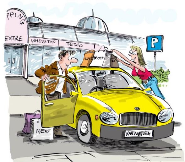
...going home and happy!