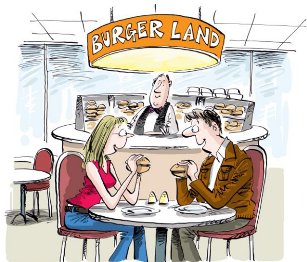
...grabbing a bite to eat