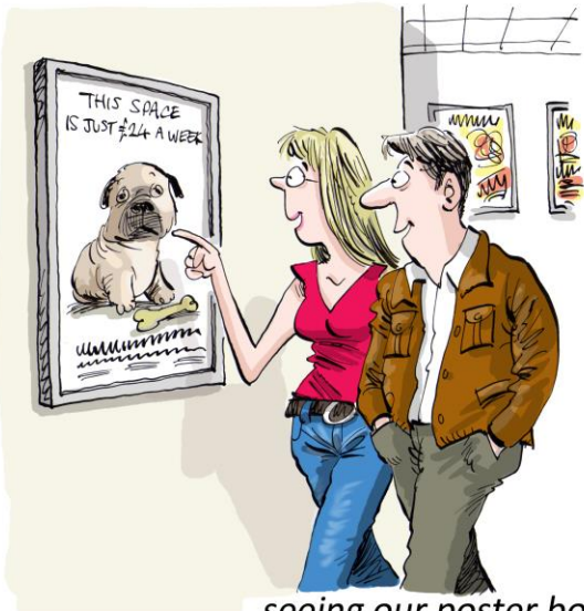
...seeing our poster boards