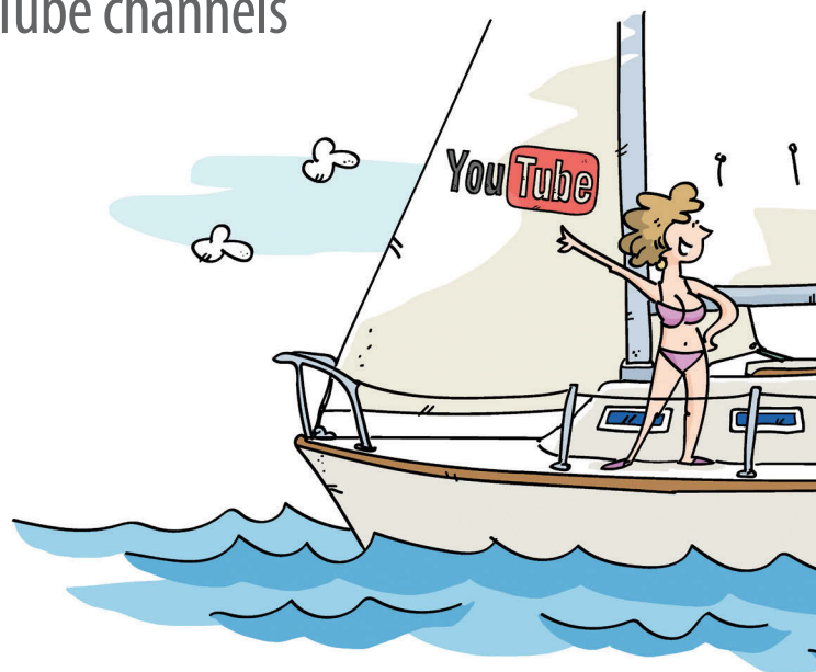
ILLUSTRATION BY TOM PAYNE

Note that, because YouTube is under the Google umbrella, anyone who has Google account of any kind can automatically gain access to a YouTube account by signing in with the