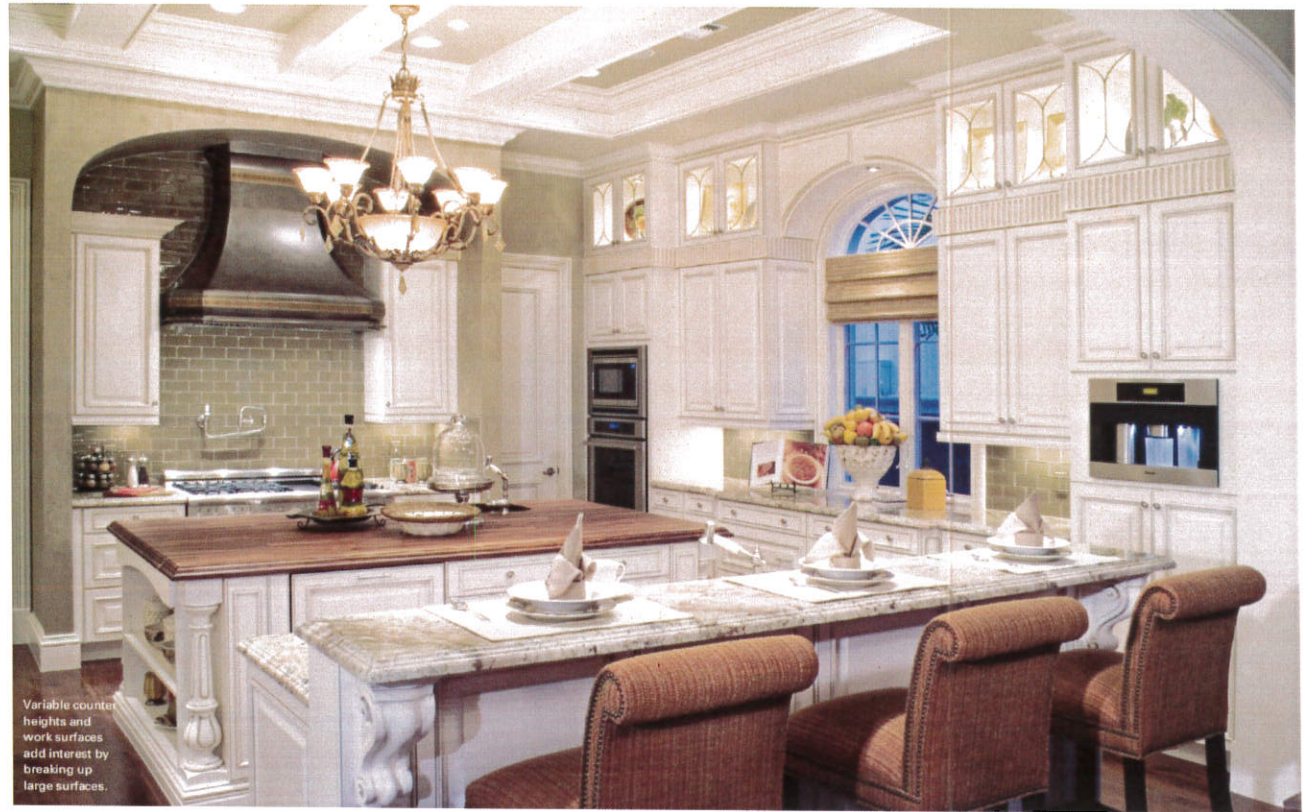
Variable counter heights and work surfaces add interest by breaking up large surfaces.

and fabric is incorporated throughout the home in varying degrees, providing a seamless flow between various spaces.