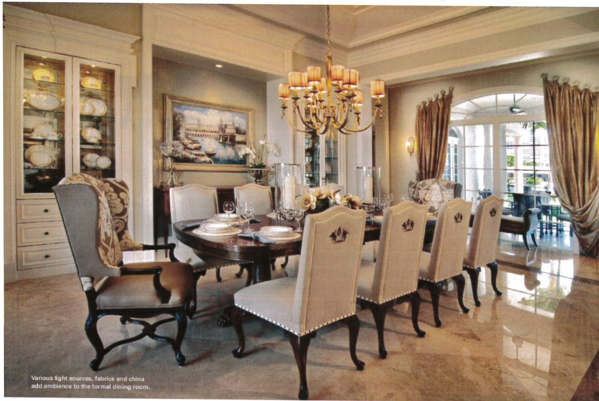
Various light sources, fabrics and china add ambience to the formal dining room.