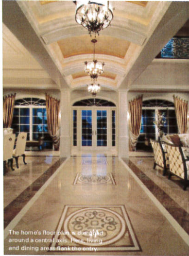
The home's floor plan is designed around a central axis. Here, living and dining areas flank the entry.