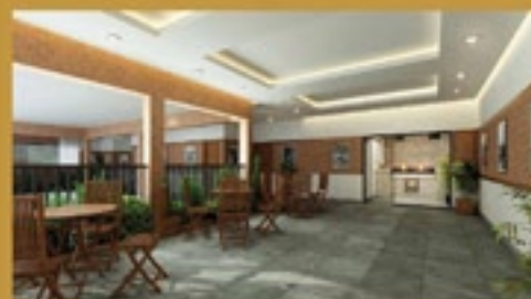
PARTY AREA @ THE CLUB