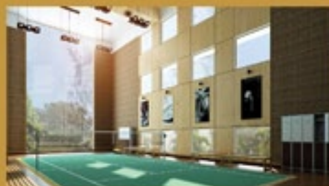
BADMINTON COURT @ THE CLUB