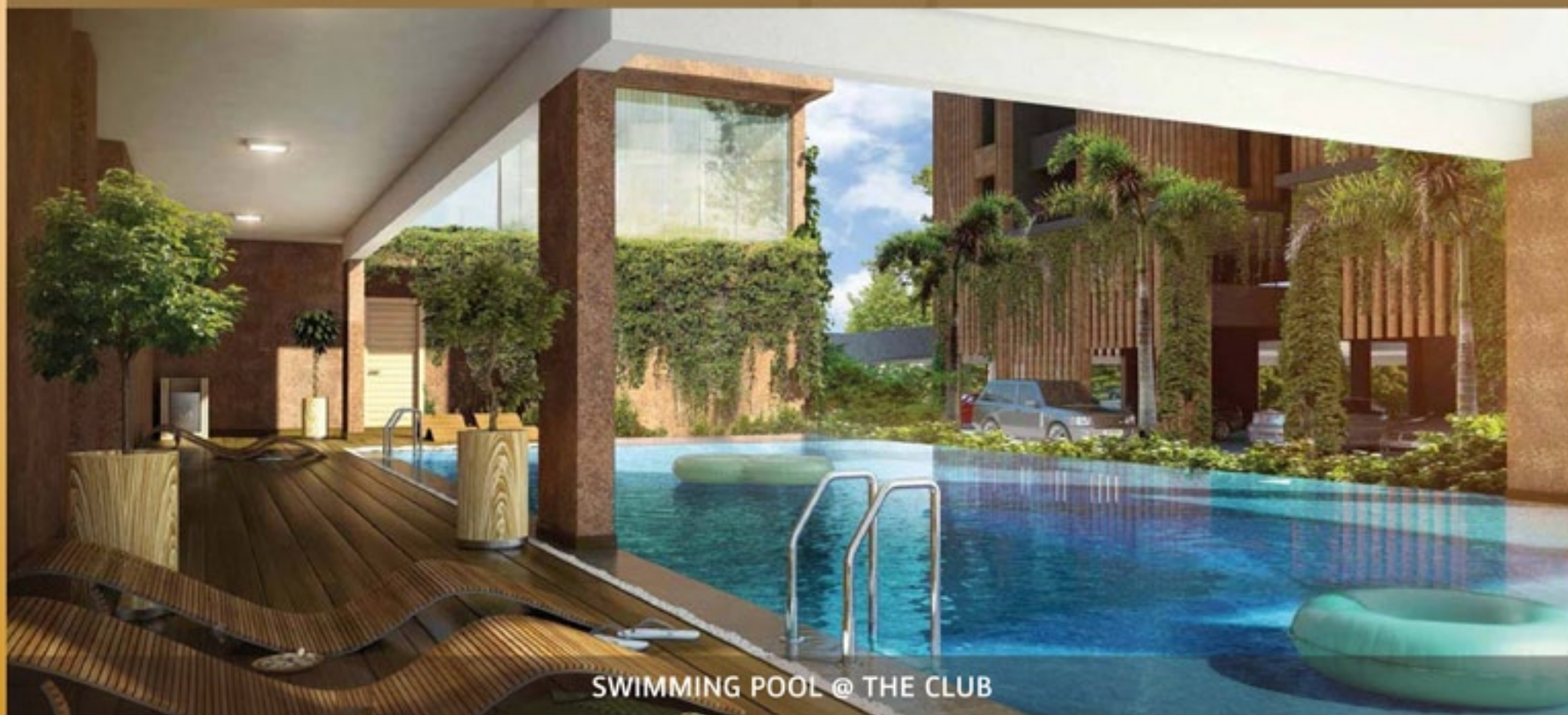
SWIMMING POOL @ THE CLUB