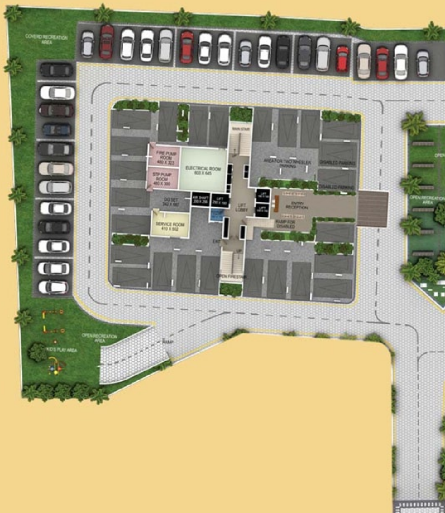
GROUND FLOOR - LAY OUT