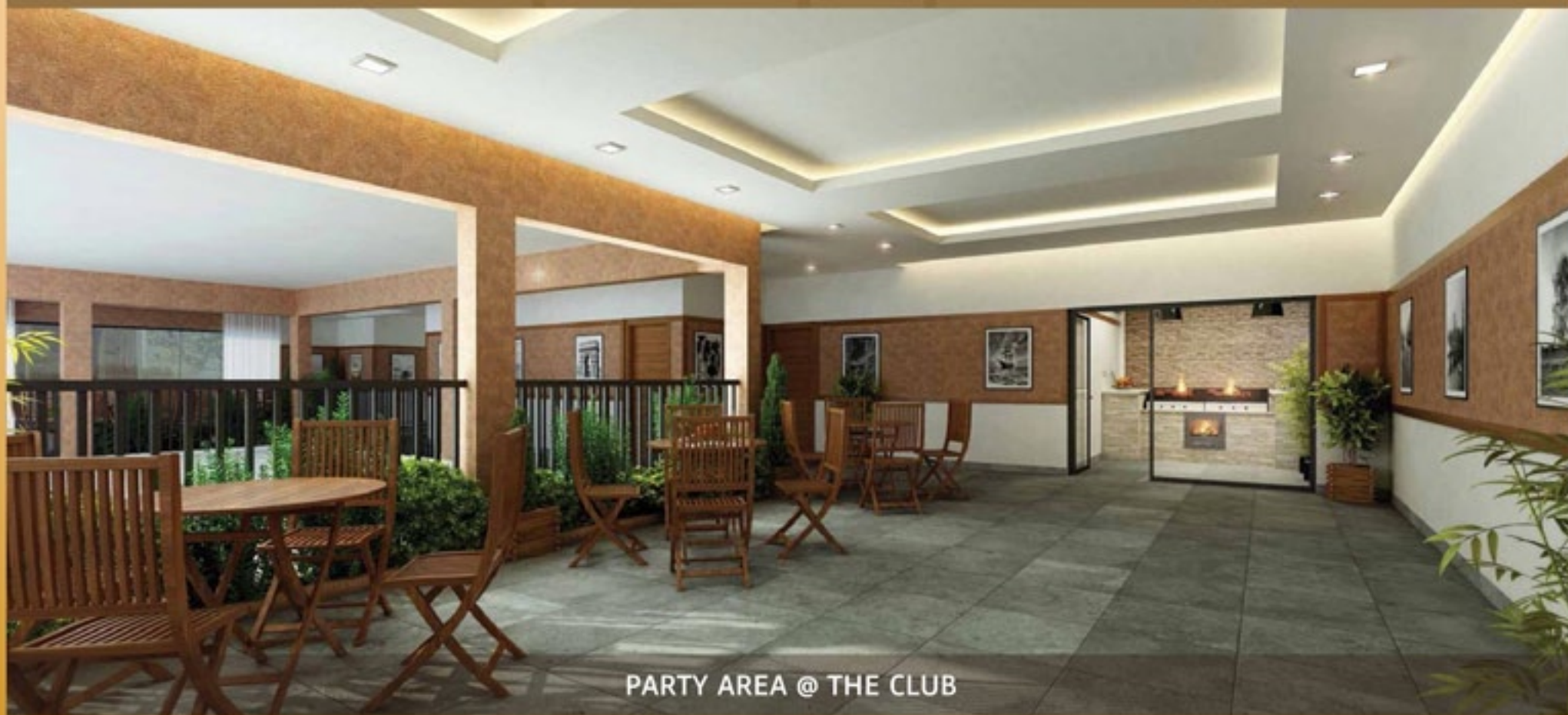
PARTY AREA @ THE CLUB