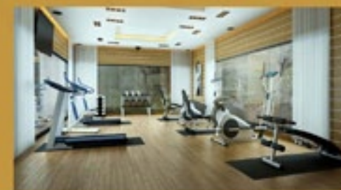
CLIMATE CONTROLLED GYMNASIUM