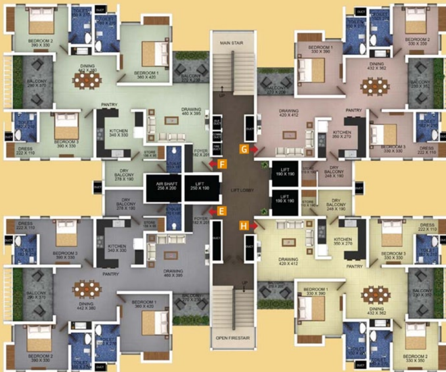
TYPICAL FLOOR - LAY OUT