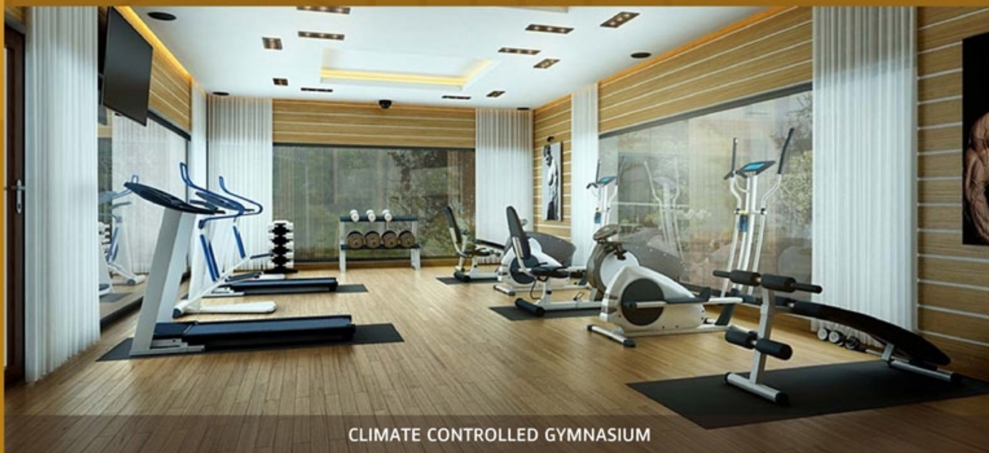
CLIMATE CONTROLLED GYMNASIUM