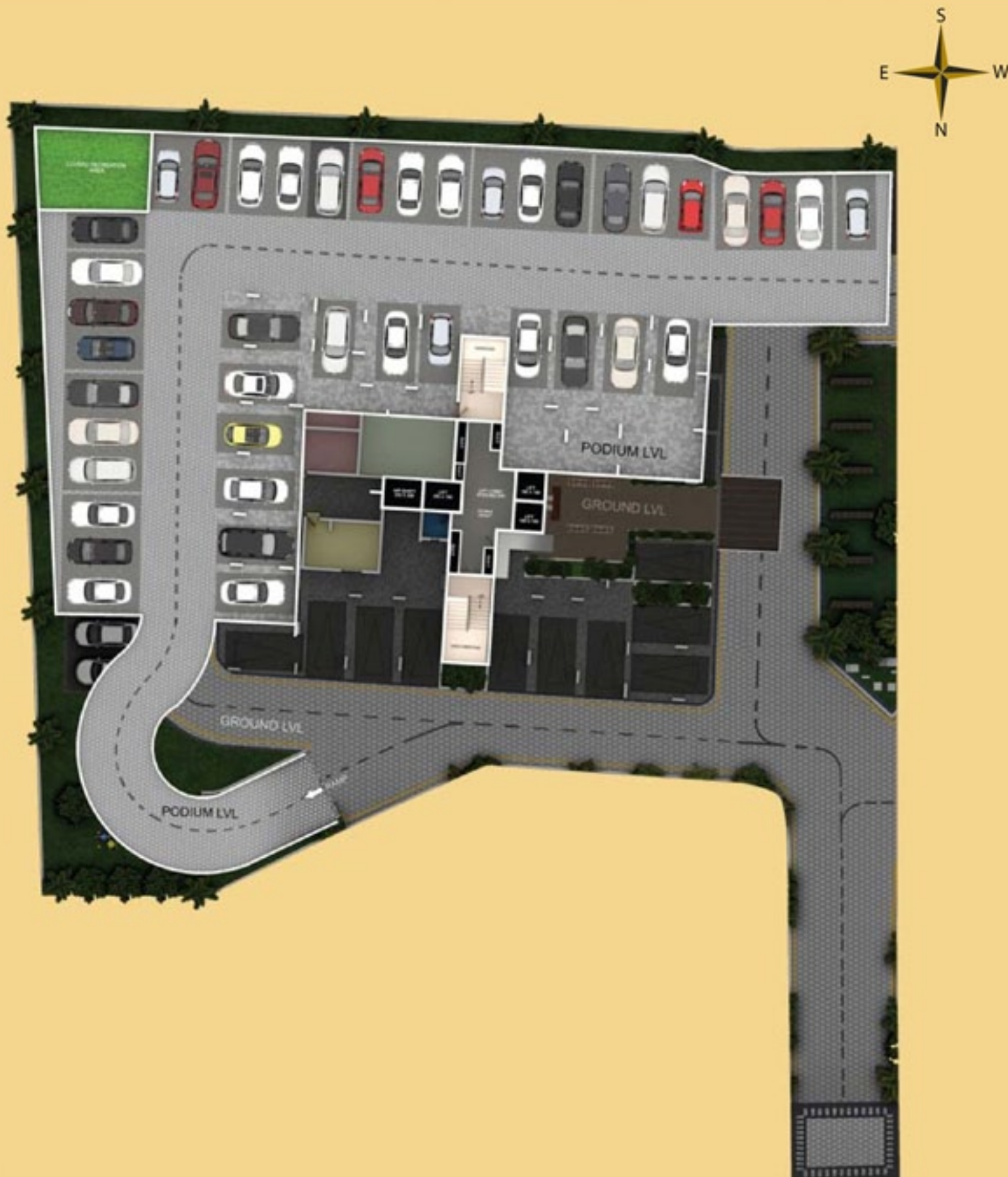
PODIUM - LAY OUT