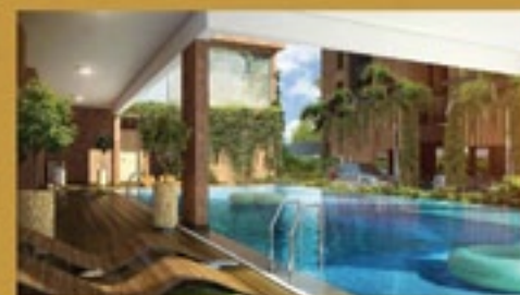
SWIMMING POOL @ THE CLUB