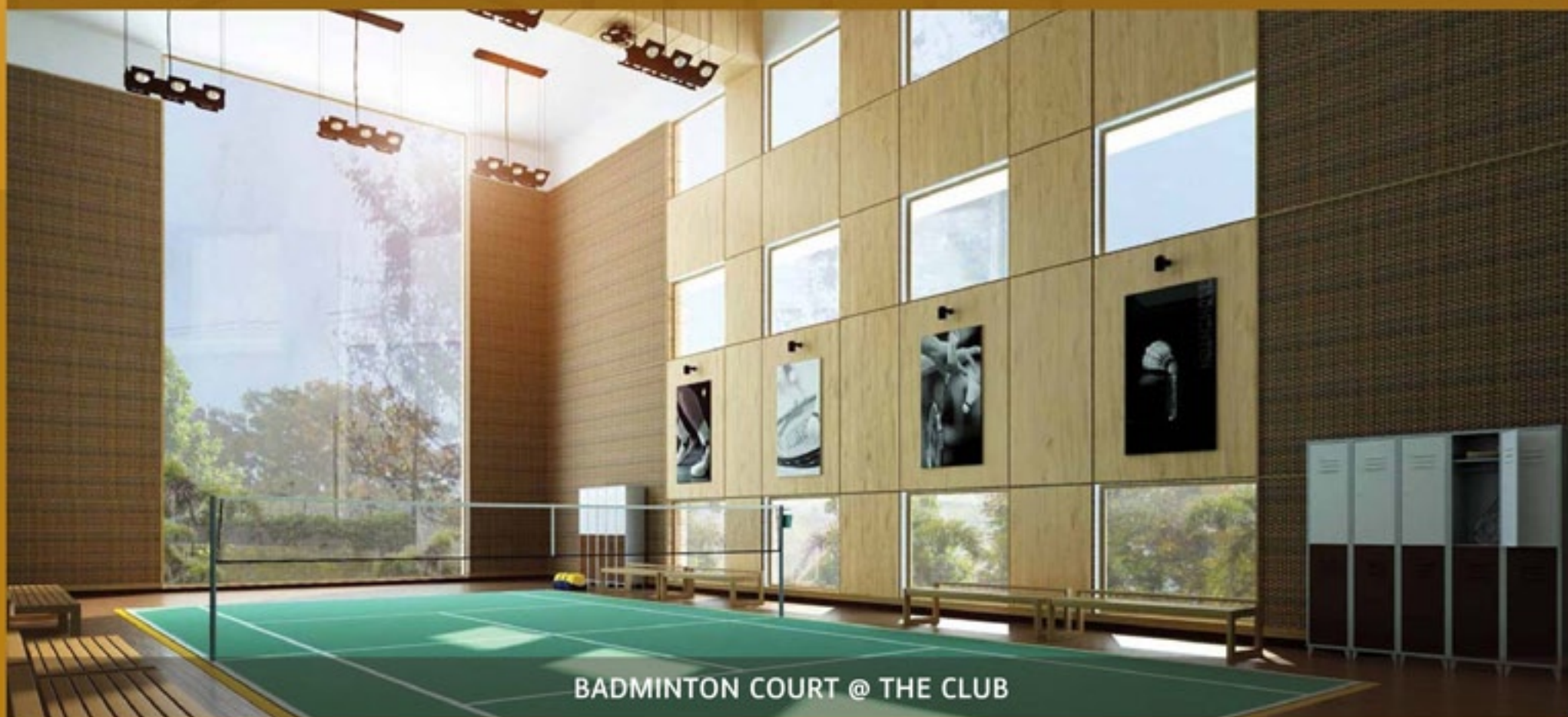
BADMINTON COURT @ THE CLUB