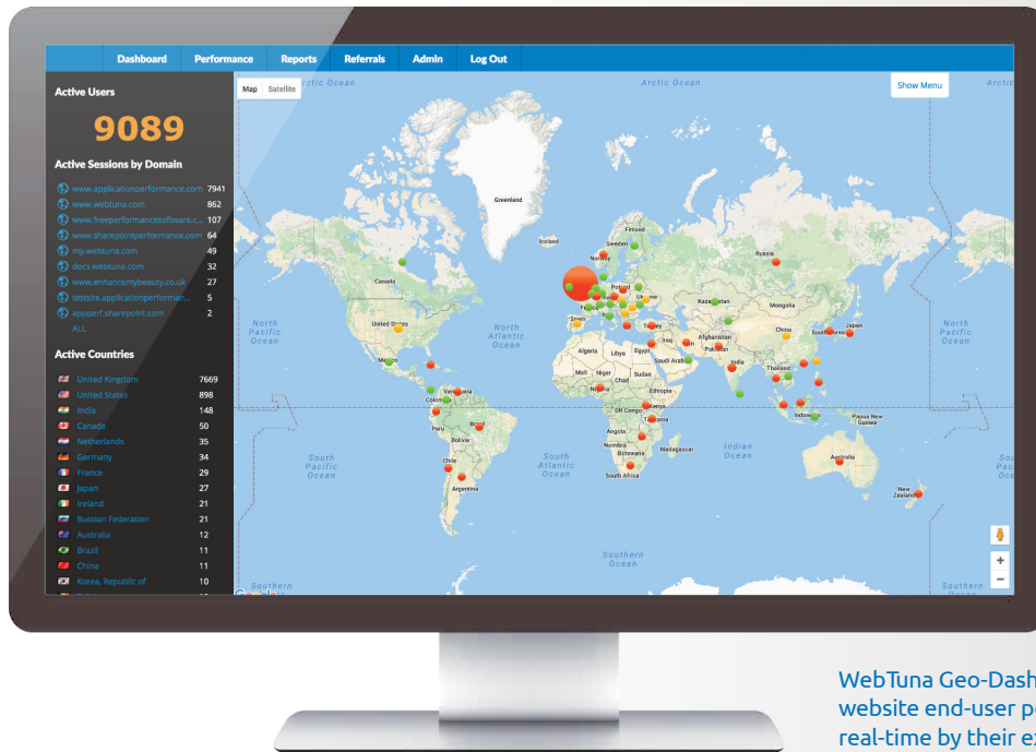
WebTuna Geo-Dashboard - visualise website end-user performance in real-time by their exact location

Whether your users access SharePoint on-premise or via Office 365 you can use WebTuna to track the actual Real-User experience and performance they receive.