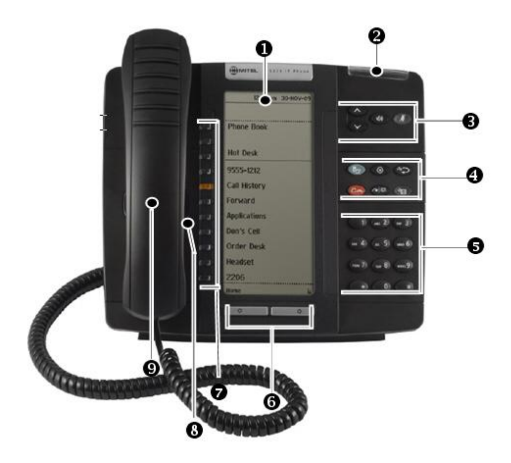
The 5320 IP Phone

The 5320 IP Phone supports Mitel Call Control (MiNet) protocol and session initiated protocols (SIP). It also supports Hot Desking and Clustered Hot Desking as well as Resiliency. The 5320 phone is ideal for executives and managers, and can be used as an ACD Agent or Supervisor Phone, as well as a Teleworker Phone.