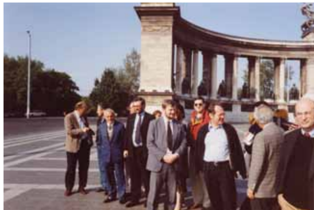
Study group in Budapest 1992. Colleagues from Eastern Europe and the EC meet.

In between congresses International Study Groups have been arranged, quite often in the country due to host the next congress. These regional study groups stimulated research within our field, arranged meetings with local colleagues and other mental health officers and prepared presentations for the next congress. In later years the study groups have been complemented by research seminars with the aim of stimulating younger colleagues to engage in research work. Study groups have been led by officers of the Executive Committee of IACAPAP and by invited experts.