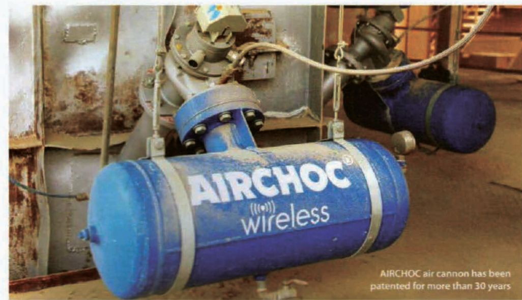
AIRCHOC air cannon has been patented for more than 30 years

Standard Industrie International is renowned in five continents and has emerged as a world leader in its field. More than 20 years, the company specialized in bulk handling solutions has been working on the African market with different type of industries such as cement plants, mines, quarries, etc. ■