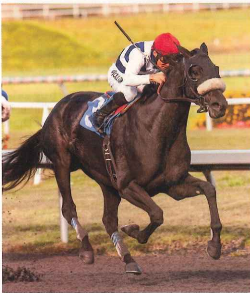
BENNOT & ASSOCIATES