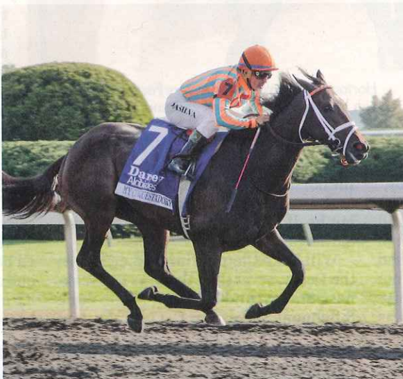
Golden Artemis, the dam of My Conquestadory (above), sells carrying a full sibling at the Fasig-Tipton November sale

and, probably as important or maybe more important, it seems like confidence has been restored to the marketplace to take advantage of the opportunities that are going to exist in coming years. People feel much better about participating in our sport and industry than they have in several years.”