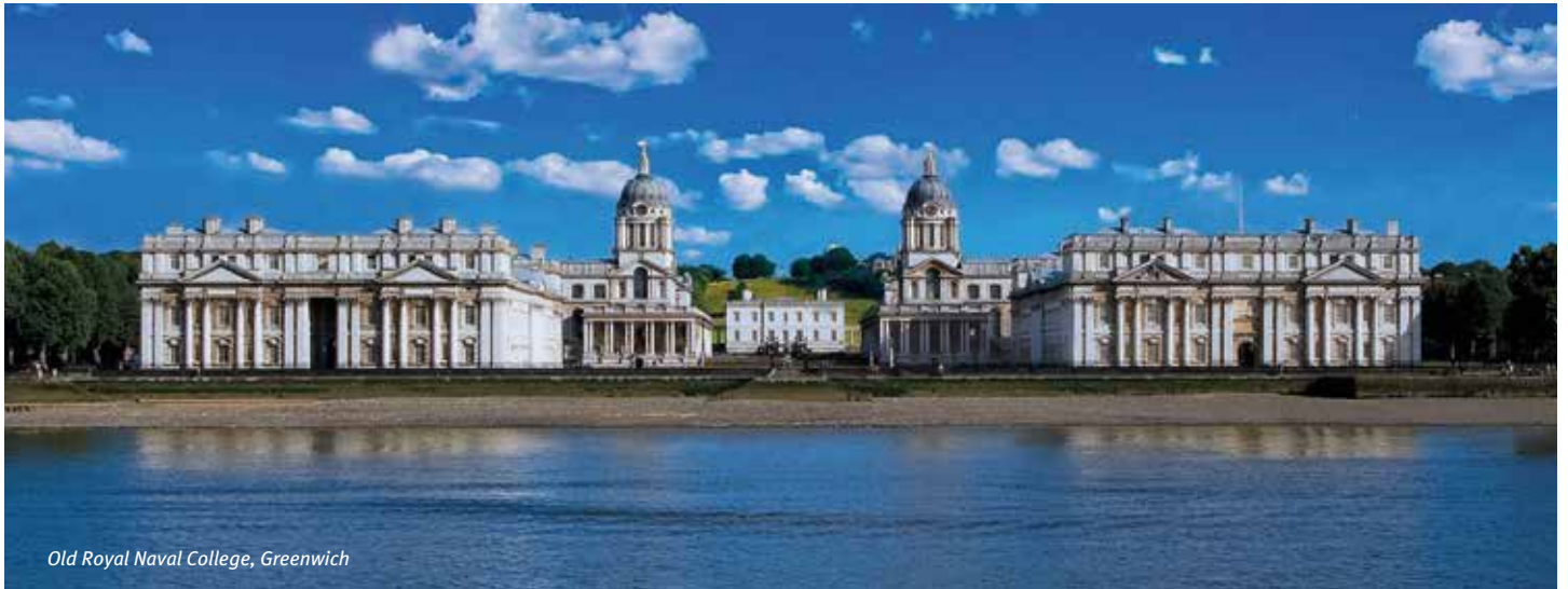
Old Royal Naval College, Greenwich