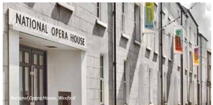
National Opera House, Wexford

Dorchester 01305 251007 hklaw.eu/dorchester