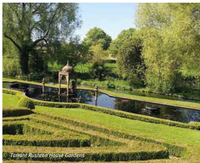
Tarrant Rushton House Gardens