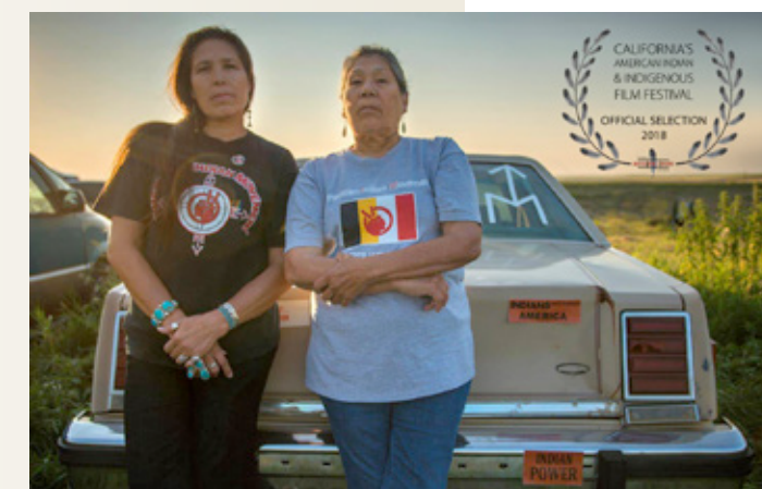
“Warrior Women”, CAIIF Official Selection, Southern California Premier

CAIIF offered audiences in Southern California some of the finest work in American Indian film and media, highlighting the best of current films from American Indian filmmakers, producers, directors, and actors working throughout Indian Country.