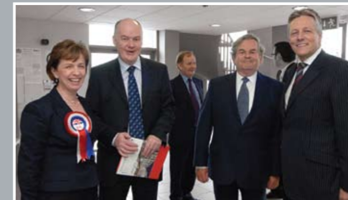
First Minister, Peter Robinson MLA and MEP Diane Dodds on a visit to Omagh Business Centre

For further information on property available through the LEA network, please contact your local Agency.