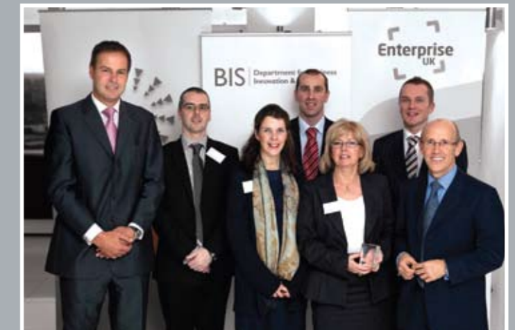
Dragons' Den star Peter Jones knows a thing or two about lending money - he is pictured here with staff from North West Marketing

Alternatively: Telephone (028) 7776 3555 (Option 2) Or email: loanfund@enterpriseni.com