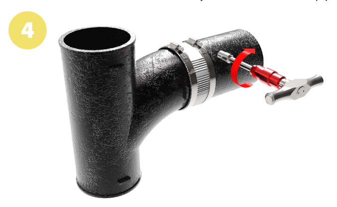
Tightening Guidelines: (see 2 Band and 4 Band below)

Butt ends of no hub cast iron pipe or fitting together inside the gasket until both are firmly seated against the center stop of gasket. Center the stainless steel shield assembly over the gasket.