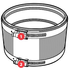
2 BAND COUPLING