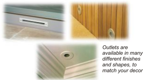
Outlets are available in many different finishes and shapes, to match your decor

The System's modular air handlers can be easily installed in lofts, cupboards, voids and crawlspaces; its sound-attenuated 89mm flexible supply ducting easily run through and around existing construction. This ducting delivers conditioned air through a number of small outlets which can be positioned in ceilings, walls or even the floor.