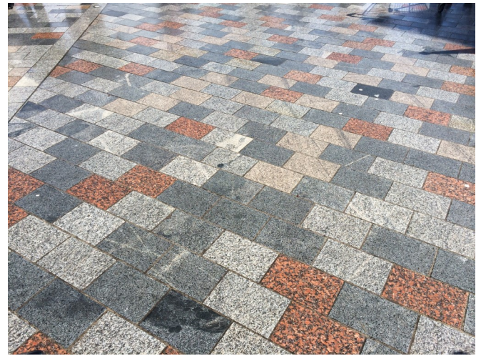
Protected with PureScape-CE