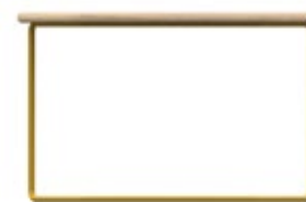
PENTA Table □ 42 □ 50 □ 70