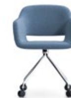
MAGDA 04 - Base 111 H 81 H 61 H 63 H 47 H 67/69