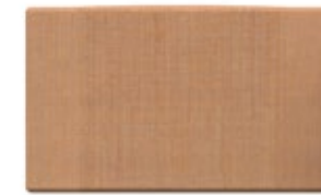
PENTA □ 42 □ 50 □ 70