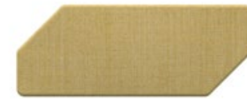
MED 1 □ 42 □ 70 □ 180