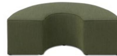
BLOOM 3 □ 42,5 □ 62,5 □ 121