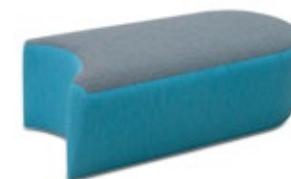
MOLECULE 4 □ 51 □ 77 □ 60-120-180