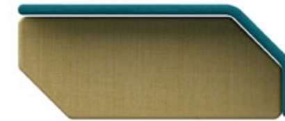
MED 2 h 95 h 74 R 184 h 42