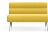
REN 130 h 90 h 75 h 130 h 43 or 47