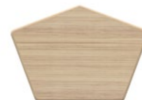
PENTA Table □ 42 □ 50 □ 70