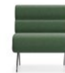
REN 1 Seater Low h 90 h 75 h 77 h 43 or 47