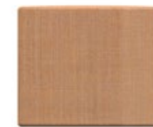
PENTA □ 42 □ 50 □ 70