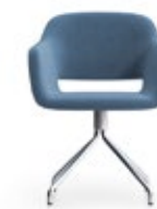
MAGDA 04 - Base 110 H 81 H 61 H 63 H 47 H 67/69