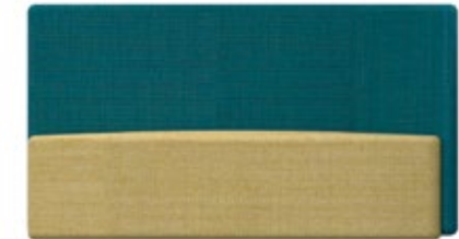
MED 2 h 95 h 74 R 184 h 42