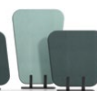
ARTY High W 185 H 126 D 24