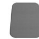
ARTY Wall 1 ARTY Ceiling 1 W 56 H 50