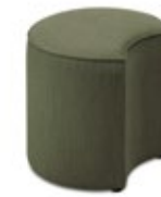
BLOOM 1 □ 42,5 □ 42,5 □ 42,5