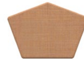
PENTA □ 42 □ 50 □ 70