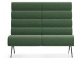
REN 2 Seater High h 130 h 75 h 154 h 43 or 47