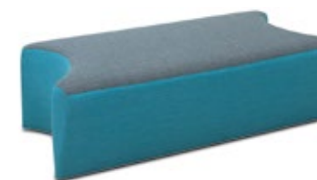
MOLECULE 3 □ 51 □ 77 □ 60-120-180