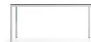
BYBLOS Table □ 75 □ 180 □ 90