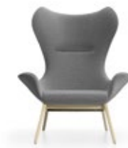
NIRVANA - 125 H 111 H 95 R 90 H 43 H 56