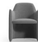
KESY 14 H 84 H 63 R 66 H 48