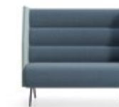
REN Office 1 Seater Medium h 105 h 75 h 117 h 43 or 47