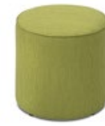
BLOOM 2 □ 42,5 □ 42,5 □ 42,5