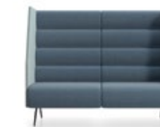
REN Office 2 Seater High h 125 h 85 h 158 h 43 or 47