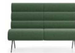
REN 2 Seater Medium h 110 h 75 h 154 h 43 or 47