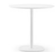
PONGO High h 76 Ø 80