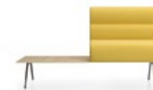
REN + Table Top h 90 h 75 h 152 h 43 or 47