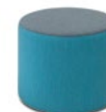
MOLECULE 5 □ 55 □ Ø 66