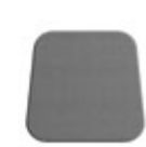
ARTY Wall 2 ARTY Ceiling 2 W 46 H 50