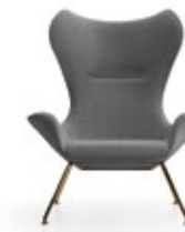
NIRVANA - 124 H 114 H 95 R 90 H 41 H 54