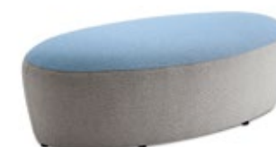
MOLECULE 6 □ 47 □ 70 □ 140