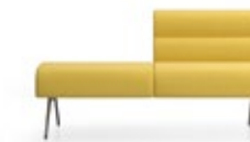
REN 1 Seater Low + 1 Seater Wait h 90 h 75 h 154 h 43 or 47