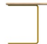
PENTA Table □ 42 □ 50 □ 70