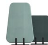
ARTY Low W 132 H 126 D 24