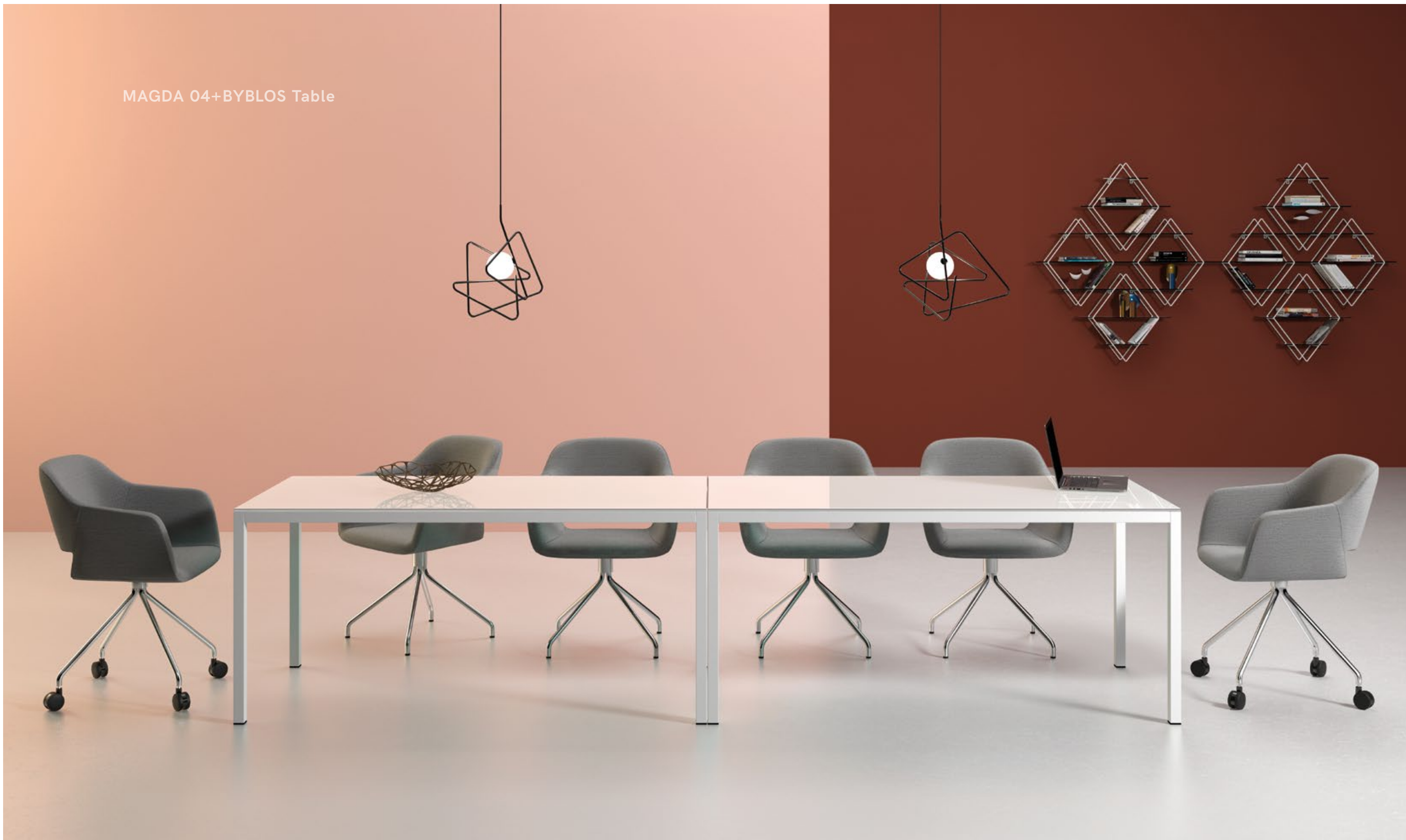
MAGDA 04+BYBLOS Table