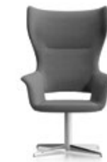
MEGAN 05HB - 120 H 122 H 74 R 82 H 42 H 61/63