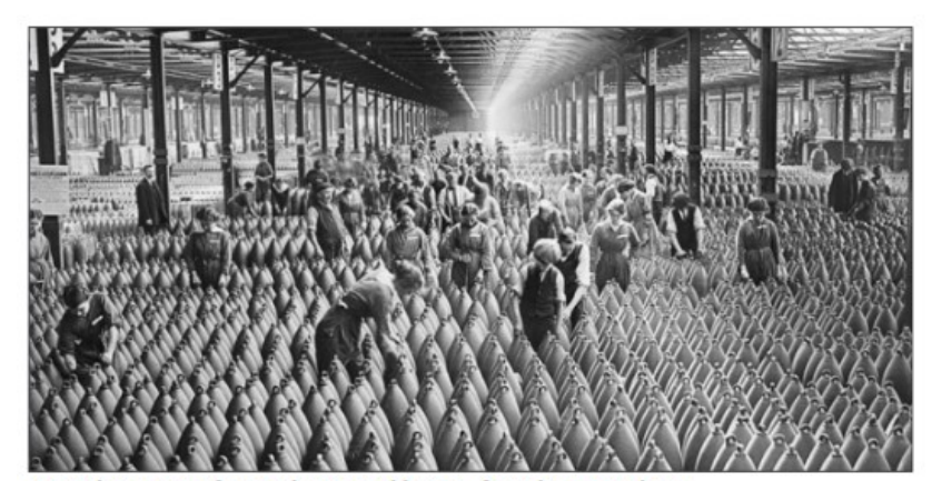
A British munitions factory during World War I... from the IWM website.

large-scale capacity. Having considered several different tape vendors, IWM ultimately decided to go with Spectra Logic. They purchased two Spectra® T950 Tape Libraries, one with LTO-5 media and drives, and one with IBM® TS1150 media and drives, along with a Spectra® BlackPearl® Converged Storage System. The museum also purchased a Spectra® ArcticBlue® Disk Solution.