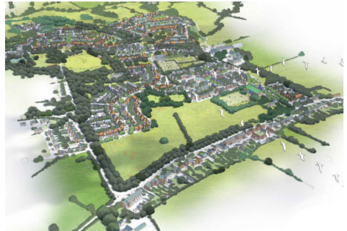
Artist impression of completed development

Post-intrusive works included comprehensive gas and groundwater sampling, chemical and geotechnical testing and the production of a GIR.