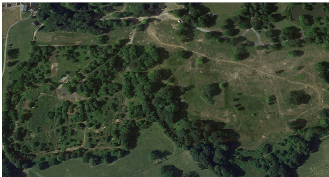
Former Whittingham Hospital site, before and after demolition

The main hospital closed in 1995, and following several unsuccessful attempts to promote development, the site was purchased by Homes England in 2005.