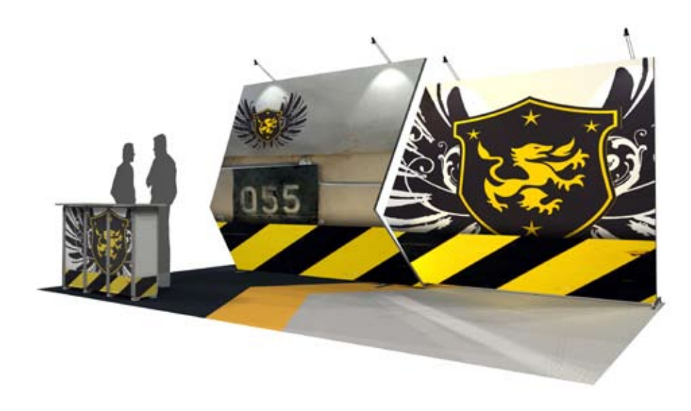
Exhibit shape, graphics, even Skyline modular carpet tiles, come together to create a powerful and cohesive brand presentation.

Make a statement with bold shapes that make an impression and say more about your brand.