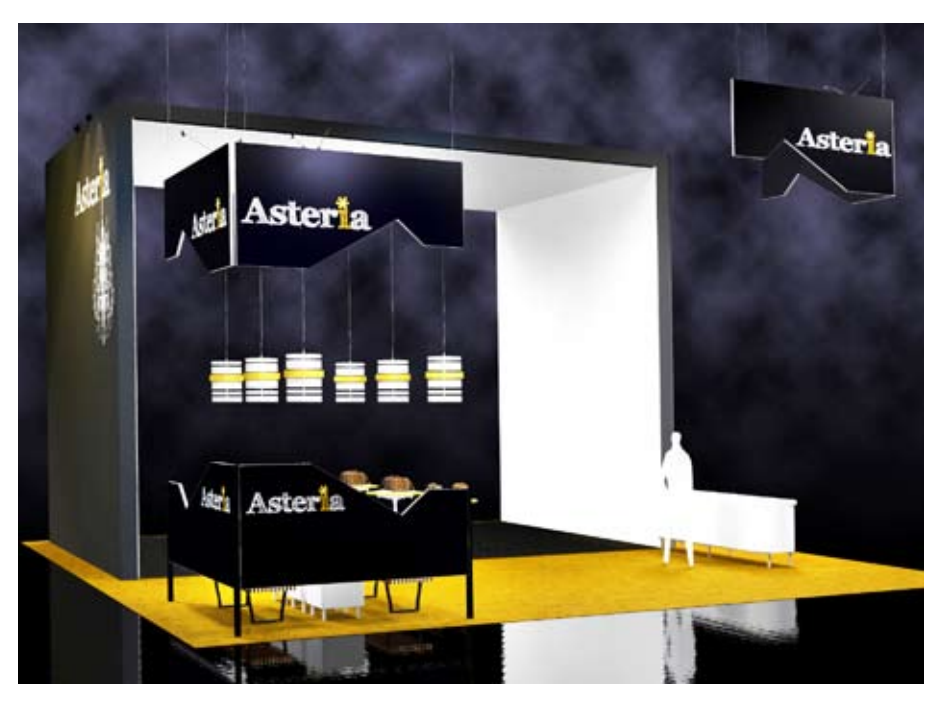
Exhibit infrequently? Rent your exhibit hardware now and leave future design possibilities open. Or rent additional components for a larger presence at your major show.

Custom shapes, and the use of positive and negative space, can create interesting areas without adding significant bulk and weight. Visually, PictureScape works with SkyTruss® structures (above) and other Skyline custom modular systems.