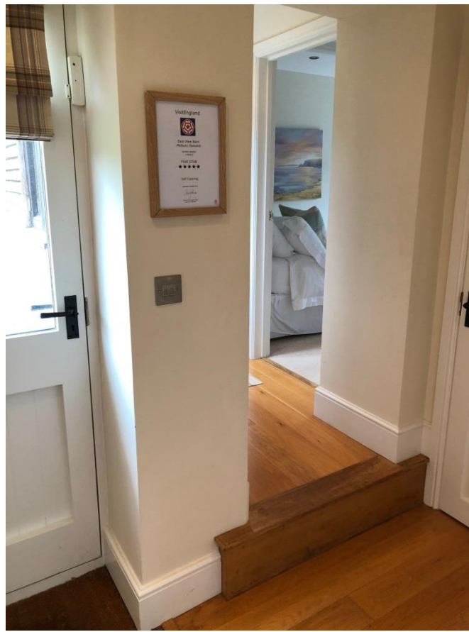
Steps to Bedrooms