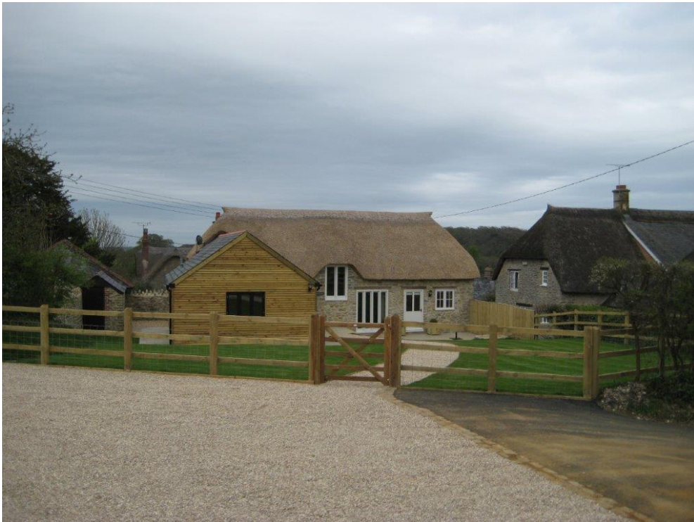
Parking at East View Barn