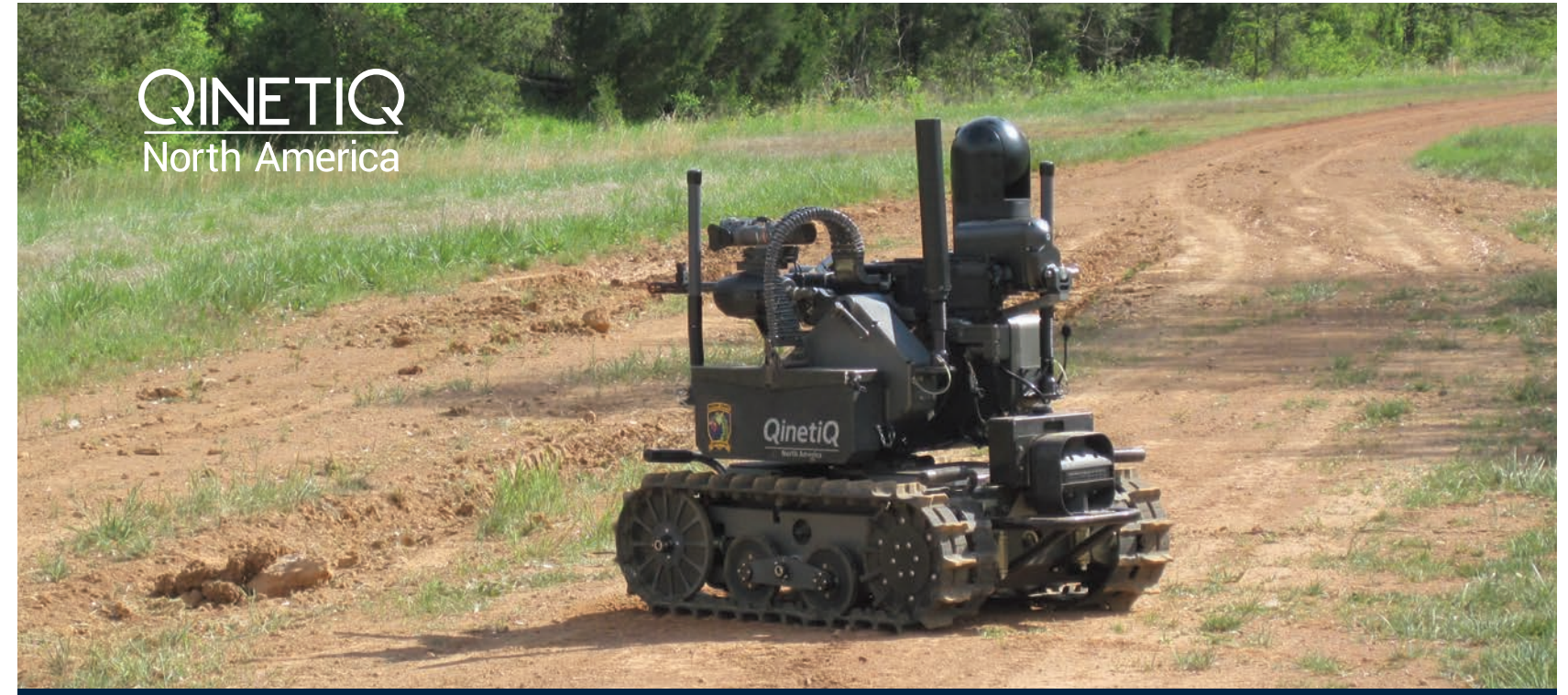
Powerful. Weaponized. Proven.