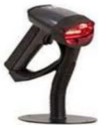
Metrologic Cordless Laser Barcode Scanner