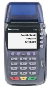
VeriFone VX570 Terminal