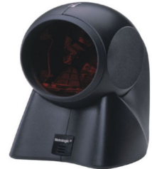
Metrologic MS7120 Orbit Omnidirectional Laser Barcode Scanner