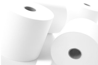
Till Rolls, Credit Card Rolls Thermal Rolls, Printer Rolls Twin Ply Rolls