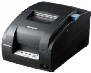
Toshiba remote receipt Printer