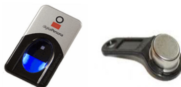
Digital Persona U.are.U 4500 Fingerprint Reader or Magnetic and non-magnetic till fobs

We also provide: Maintenance Cover Out Of Hours Cover Ribbons Rollers Twin Spools Keyboard Wetcovers Touch Screen Covers Cash Drawers