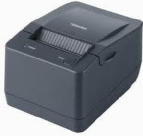
Samsung Kitchen Printer Bixelon 275C