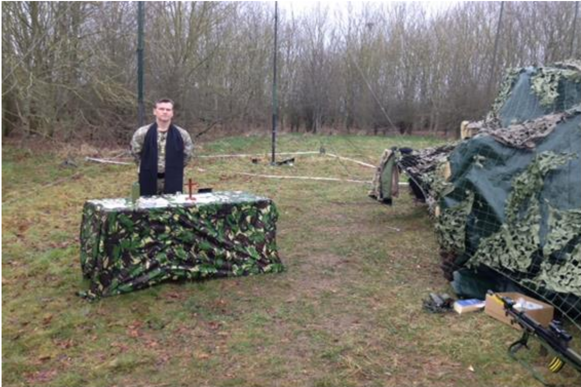
Photo of a field service

Having worked for 10 years in Parish Ministry, including 5 in Ipswich, I have spent the last three years as an Army Chaplain. I've worked with the Cavalry and now the Infantry, the Grenadier Guards. Chaplains in the Army are known as Padre, which comes from the Spanish word for Priest or Father. We do indeed play a sort of a Father-like role to the soldiers, most of whom are young men.