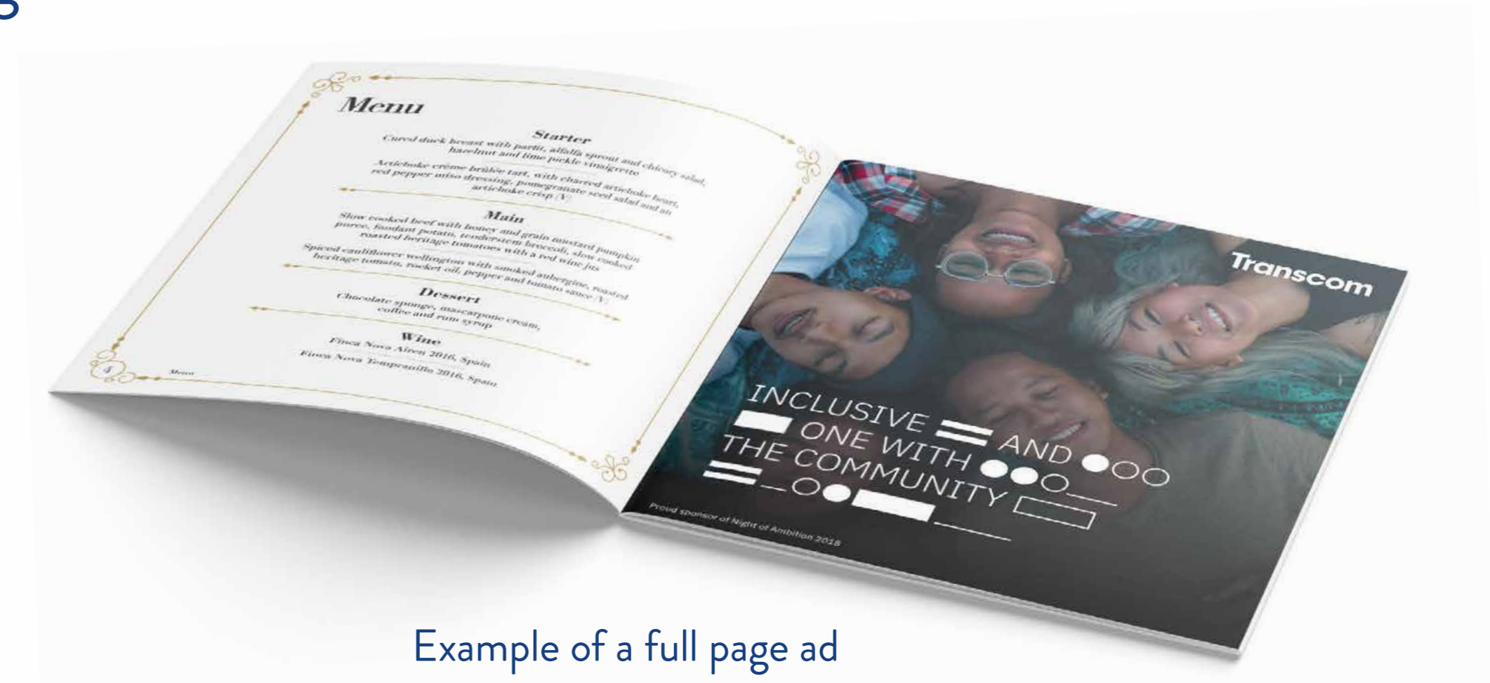
Example of a full page ad