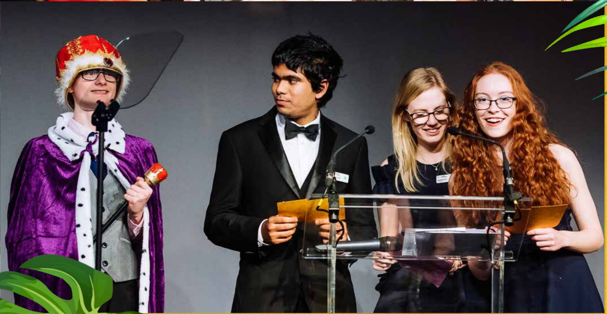
Images from Night of Ambition 2018