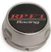
Optional cap for 15x8, 16, 17, and 18 inch RPF1 (A379-0000SP)