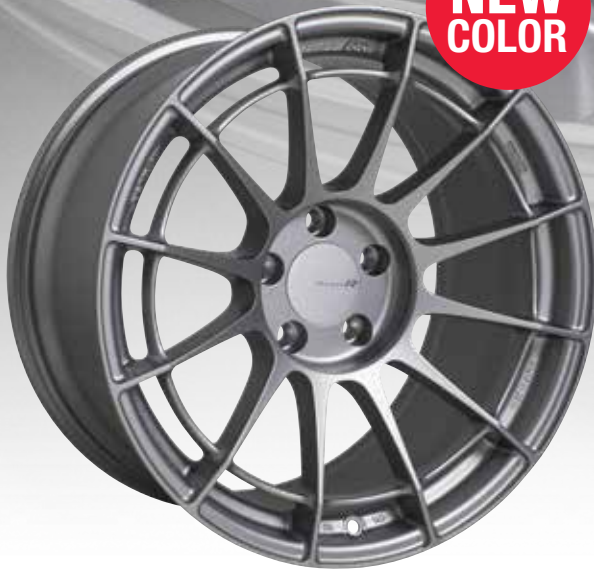
Matte Silver (Limited Sizes / Special Order)