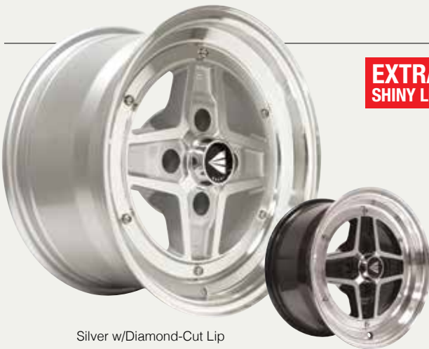
Silver w/Diamond-Cut Lip