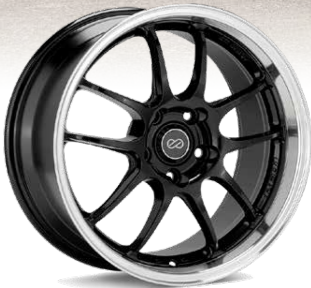
Gloss Black w/Machined Lip (17x9 pictured)