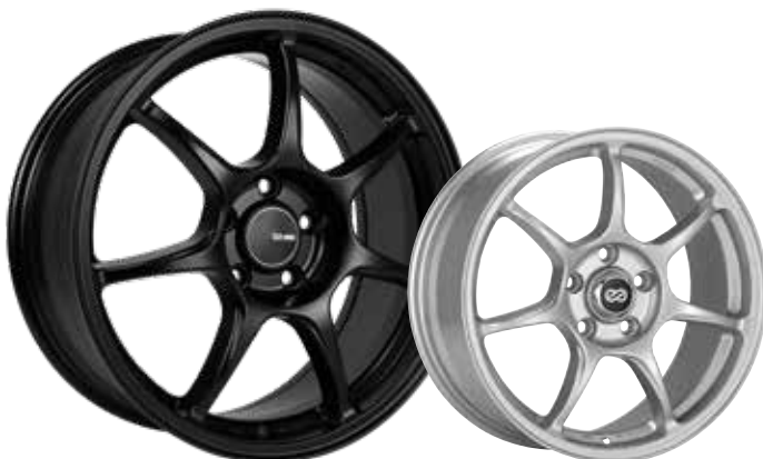
Matte Black (with optional flat cap)