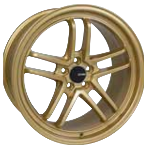
Gold (Select Sizes)