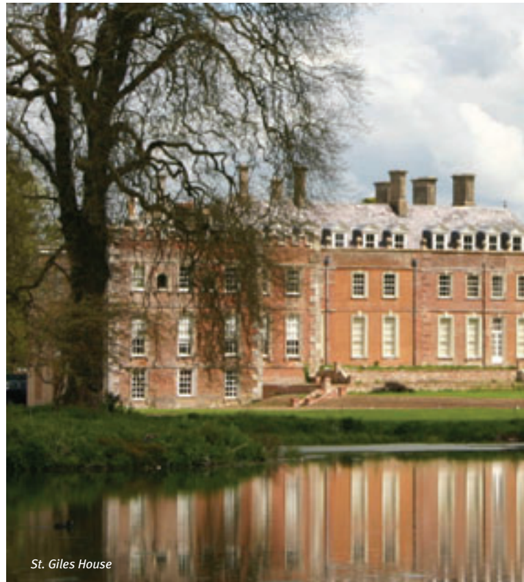
St. Giles House

Disabled drivers will be able to park nearer the house. Marshals will be on duty to guide you.