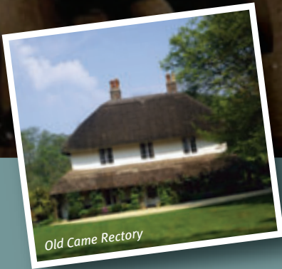
Old Came Rectory