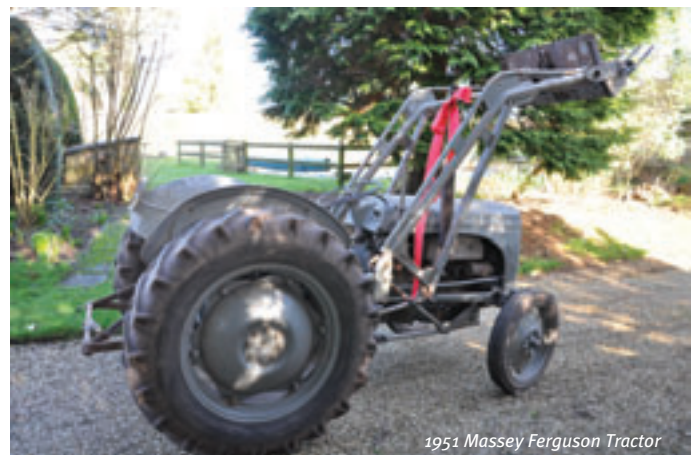
1951 Massey Ferguson Tractor