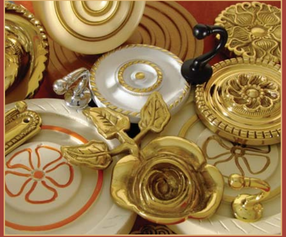
Decorative Hooks and Holdbacks