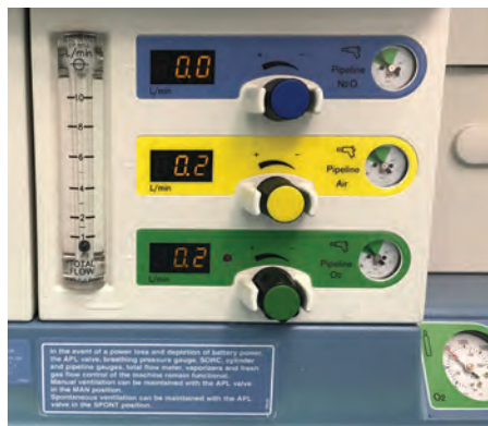
Photo of an anesthesia machine flowmeter set to deliver very-low-fresh gas flow during general anesthesia.

The information I received from GE included some sales material about GE’s Medisorb EF CO 2 absorber which contains 75% calcium hydroxide and less than 1% sodium hydroxide. The sales material stated that GE Medisorb EF (when desiccated) produced less Compound A and carbon monoxide than the regular Medisorb (75% calcium hydroxide, 3% NaOH). However, no data were presented quantifying the levels of Compound A and carbon monoxide by-products with Medisorb EF and plain Medisorb vs. other CO 2 absorber products. I was also provided with a July 2013 memo from a GE Director of Commercial Marketing indicating that GE anesthesia machines could only use GE-validated and GE-compatible parts and accessories, like Medisorb and Medisorb EF CO 2 absorbers. The memo indicated the GE service warranty is only valid if GE-validated and GE-compatible products (like Medisorb) were used with the GE anesthesia machines. The memo did not specifically state that other CO 2 absorber products (Litholyme, Amsorb, Amsorb Plus, etc.) were not GE-validated, -compatible, or -approved. It did not state that only GE Medisorb products could be used with a GE anesthesia machine. I was also informed that the Director of Commercial Marketing who penned the memo is no longer with GE.