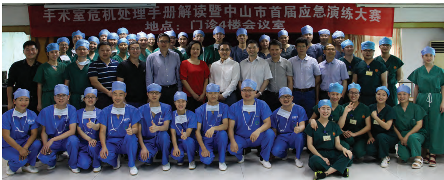
Figure 4. The Operating Room Emergency Manuals Simulation Training Competition was organized in Zhongshan, Guangdong, China. The participating teams included People's Hospital of Zhongshan, Hospital of Traditional Chinese Medicine of Zhongshan, Boai Hospital of Zhongshan, Zhongshan Torch Development Zone Hospital, Huangpu People's Hospital of Zhongshan, Zhongshan Dongshen Hospital, and Zhongshan Banfu Hospital.