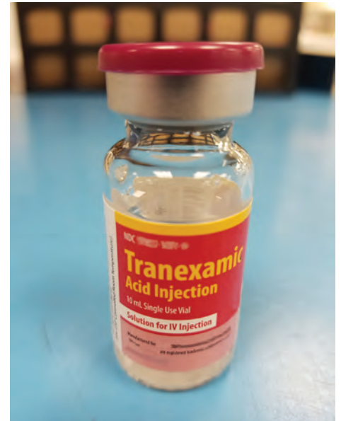
Figure 1. Tranexamic Acid.

The trial had some weaknesses. During the study, the investigators noted that enrollment often occurred concurrently with the decision to