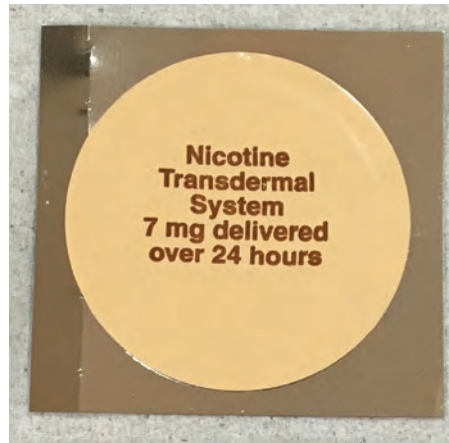
Transdermal nicotine patch containing metal particles.

Your question about the risk of patient injury from a transdermal drug patch during surgery raises questions about both the potential for a burn, as well as alterations in medication delivery from the patch. The absence of case reports of significant patient harm from metal-containing patches is reassuring, but does not eliminate the concern for patient injury. In addition, removing the patch creates the risk of suboptimal medication delivery unless an alternate formulation of the drug is provided. Furthermore, transdermal patches provide consistent medication delivery, resulting in stable serum concentrations, which may be difficult to re-establish in the perioperative period leaving the patient at risk for under- or over-dosage. Ultimately, the risk of removing the patch should be weighed against the risk of injury if the patch is left in place.