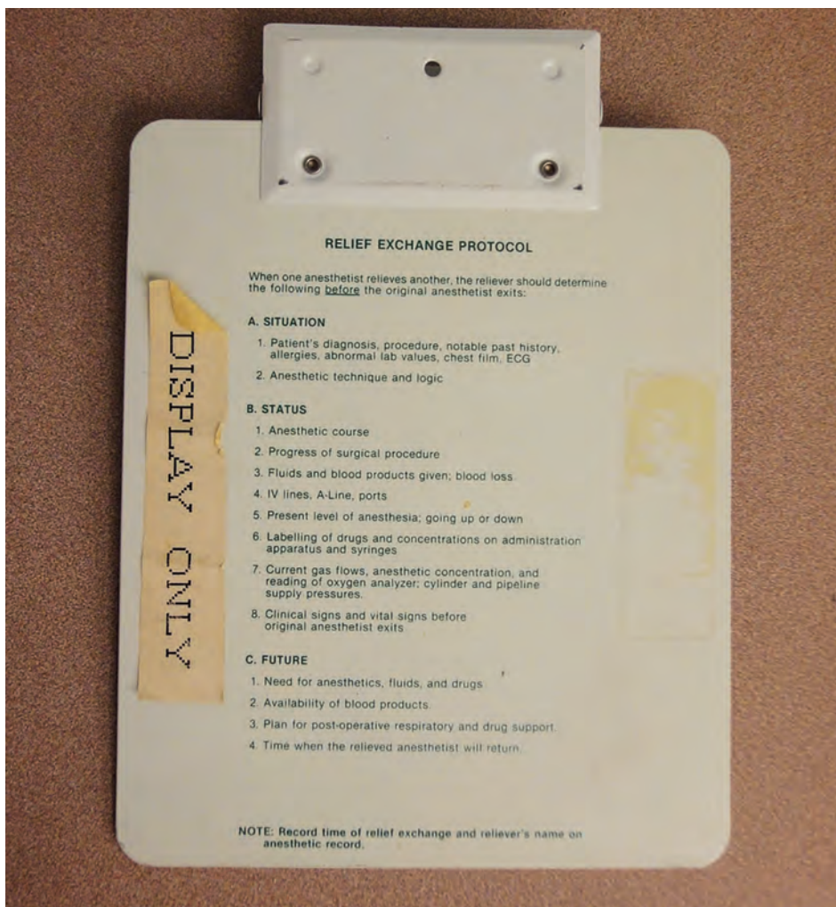
Figure 1. Cooper's suggested checklist for intraoperative handoff, as printed on the back of a clipboard.

Duty relief. Only two studies have examined duty relief, Cooper et al. in 1982 4 and Terekhov et al. in 2016. 10 Interestingly, both found an association between duty relief and improved patient outcomes. In the 1982 study by Cooper and colleagues of more than 1,000 critical incidents during anesthesia care, 28 of 96 total incidents associated with intraoperative relief were identified as favorable, where the introduction of the relief anesthesiologist led to the discovery of an error or other failure to provide optimal care. Only 10 incidents were identified as unfavorable, where some aspect of the relief process was identified as contributing to the