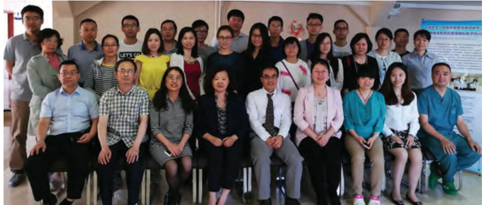
Figure 1. Participants and faculty at the Anesthesia Crisis Resource Management Simulation Workshop, Peking University People's Hospital, Beijing, China.

The participants registered for a two-day simulation training session and all participants attended interactive lectures regarding the use of an emergency manual in the perioperative environment. Then they were divided into two groups. One group used a full human patient simulator (high fidelity) mannequin, SimMan Essential