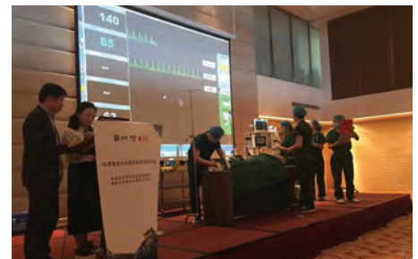
Figure 2. The 2017 Enhanced Recovery After Surgery Perioperative Management Seminar and the Anesthesia Crisis Management Simulation Workshop was held in Xiangyang, Hubei, China.

An EM simulation demonstration was part of the program at a regional anesthesia meeting. A group of anesthesiologists from the Department of Anesthesia, Xiangyang Central Hospital, formed the "simulation education team." They created