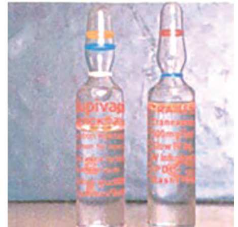
Figure 2. TXA is available in a variety of doses, vials, and ampules and can resemble bupivacaine for intrathecal use. Therefore, caution should be used when drawing up and administering TXA or bupivacaine.