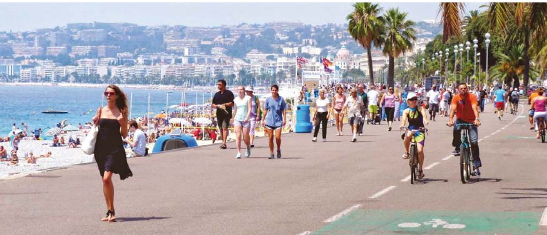
Promenade des Anglais, Nice

Windsurfing, sailing, hiking, tennis, sun-bathing, rollerblading, and skiing (Alps ski resorts are 30 miles from Nice) are some of the pleasures available on the French Riviera to be enjoyed during weekends.