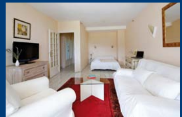
higher standard studio apt.