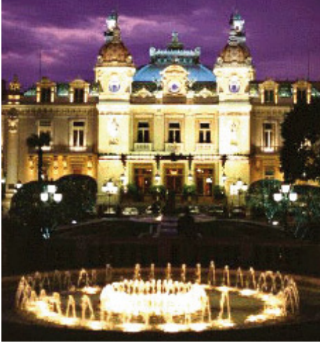
Night life in Monaco

An introductory social evening, with dancing, is held at the school on the first Friday.