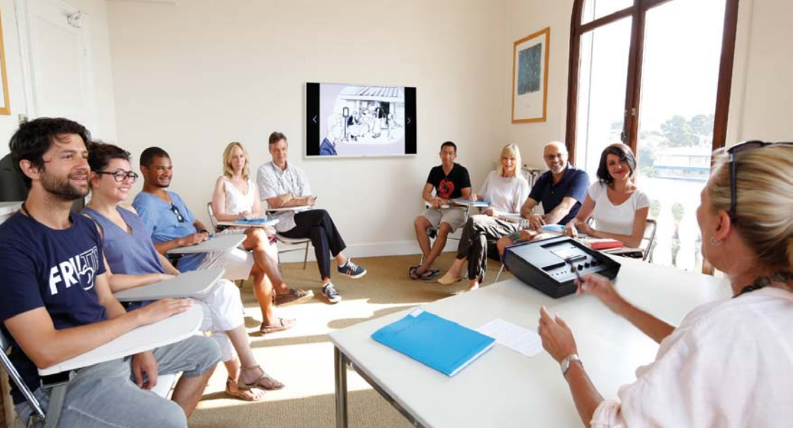
An audio-visual class