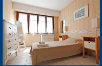
typical individual room