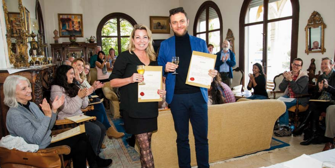
The graduation ceremony