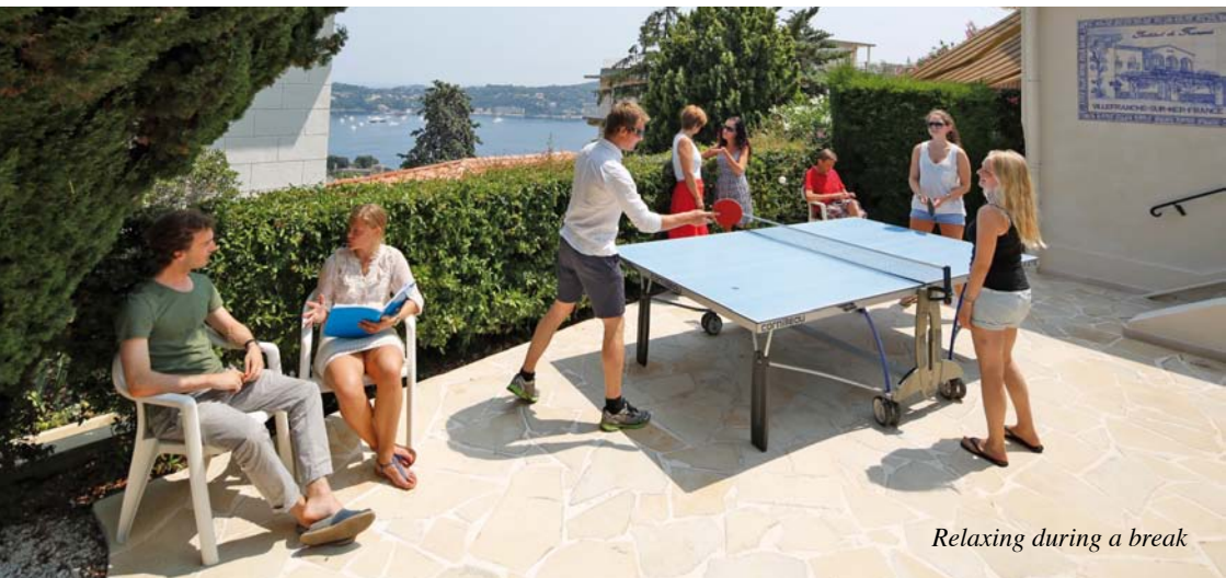
Relaxing during a break

Nice is linked to Paris by a Very High Speed Train (TGV).