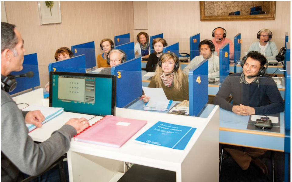
The language laboratory

A modern language laboratory is used to complement and reinforce the classroom work and, together with audio-visual aids, is at the student's disposal for accelerating his/her progress or overcoming individual difficulties.