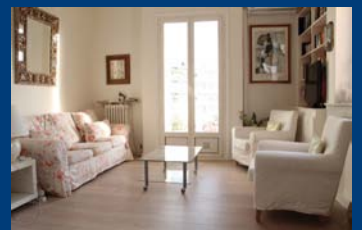
higher standard 2-room apt.