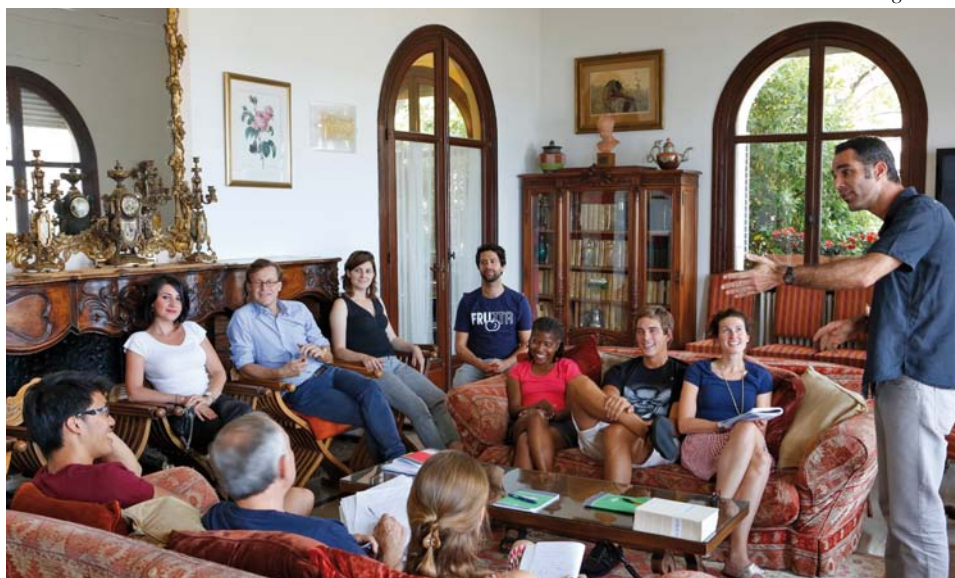
Practice session in living room

All these activities take place in a congenial atmosphere created by all concerned, and which contributes so much to the students' progress and enjoyment.