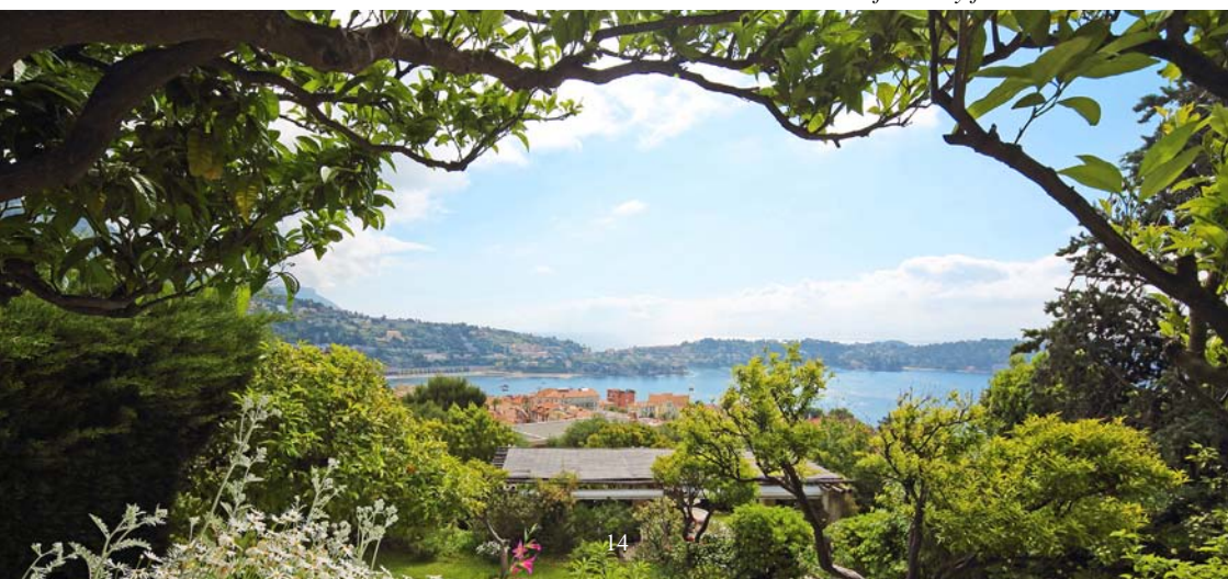
View of the bay from the school

Villefranche is a picturesque port town located just outside Nice. Set in one of the most beautiful bays of the Riviera, it is popular with sailing enthusiasts, artists and tourists. Around a quaint “old quarter”, can be found a 15th century citadel, a chapel decorated by Jean Cocteau, the Oceanographic Institute, the Sailing and Motornautic Club and many delightful little restaurants. Villefranche offers vacationers beauty, charm and historical sights that make it truly one of the outstanding spots on the French Riviera.