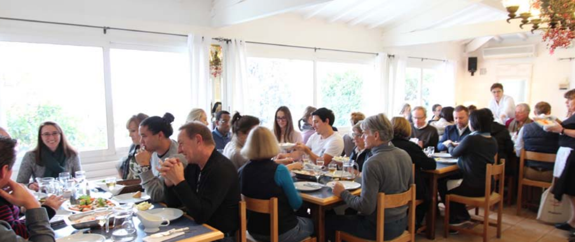
Discussion-lunch in dining room