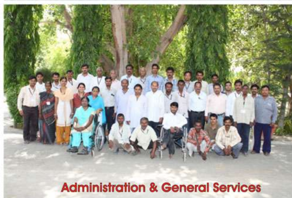
Administration & General Services