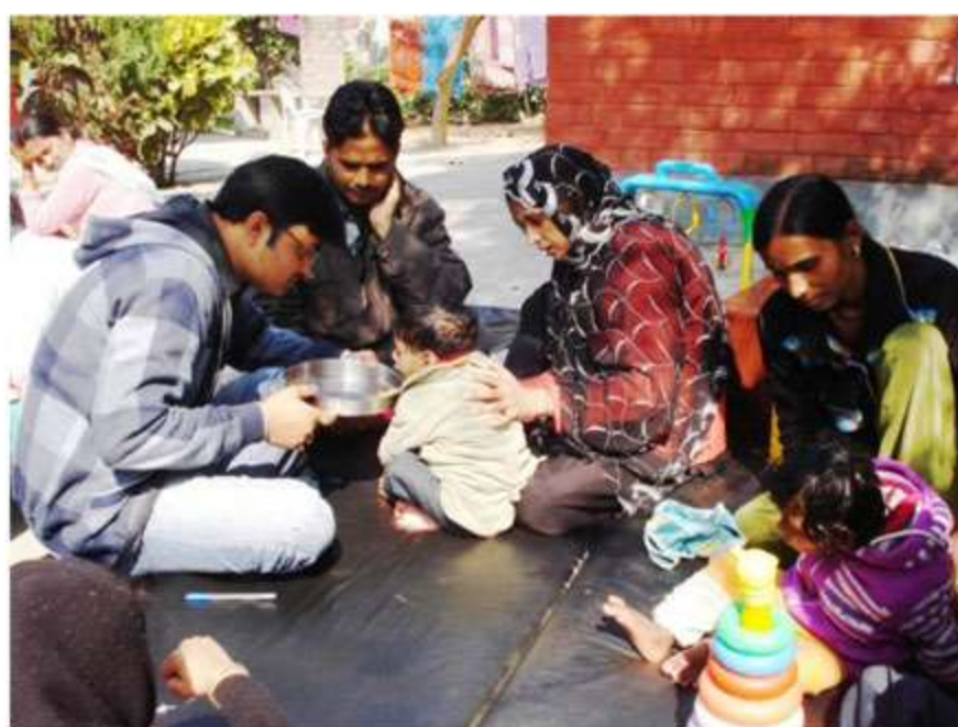
Village-Animator & Health-worker Trainings

This unit conducts trainings for mothers with their disabled child in a specially designed hostel in KIRAN-Village itself. The parents with their children have to stay with us for a 5-Days training program. Good accommodation and food is provided at nominal fee but it is free for poor parents. Every day will be a full training day, starting with need assessment and opportunities for the child. The general focus of the training is to train the parents in handling activities of daily livings and to increase the knowledge of the caretaker about the specific ability of the children with disability. Experienced Physiotherapists, Special educators, Speech therapist, Doctor and Psychologist are taking part to conduct the trainings. We also take the support of carpentry unit and orthotic workshop for special furniture and appliances for children. We organized these training programs for the parents of CP, MR and Autistic children.