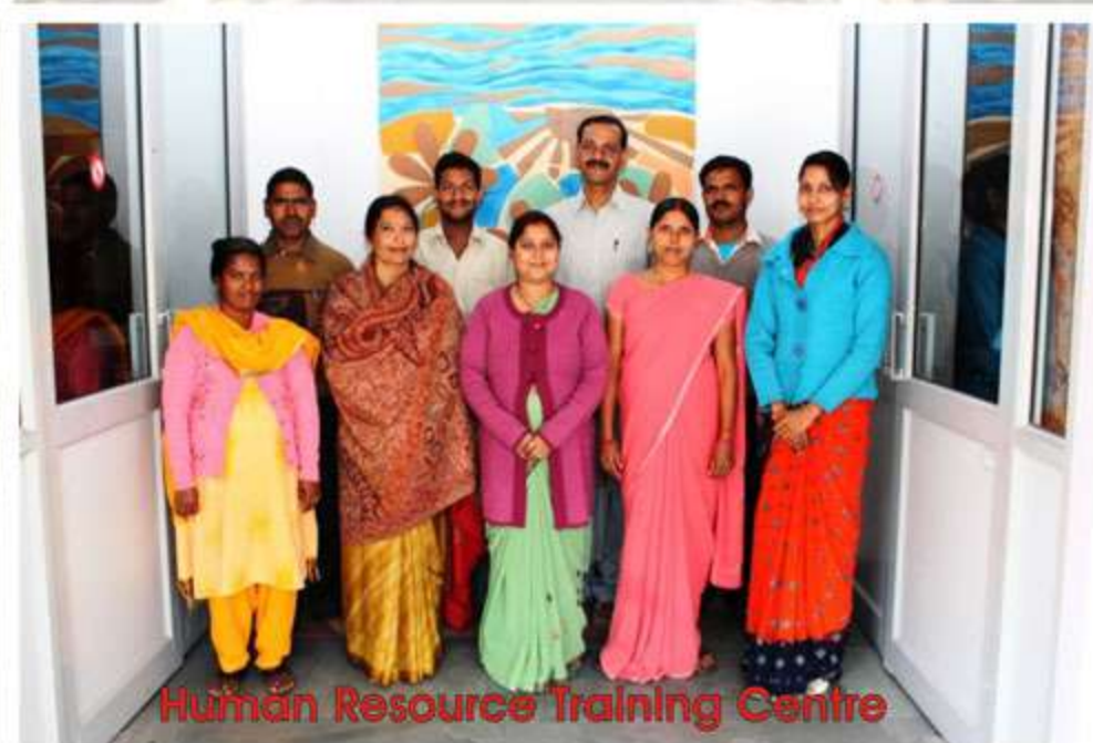
Human Resource Training Centre