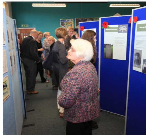
World War One Exhibition held at UTASS in June.